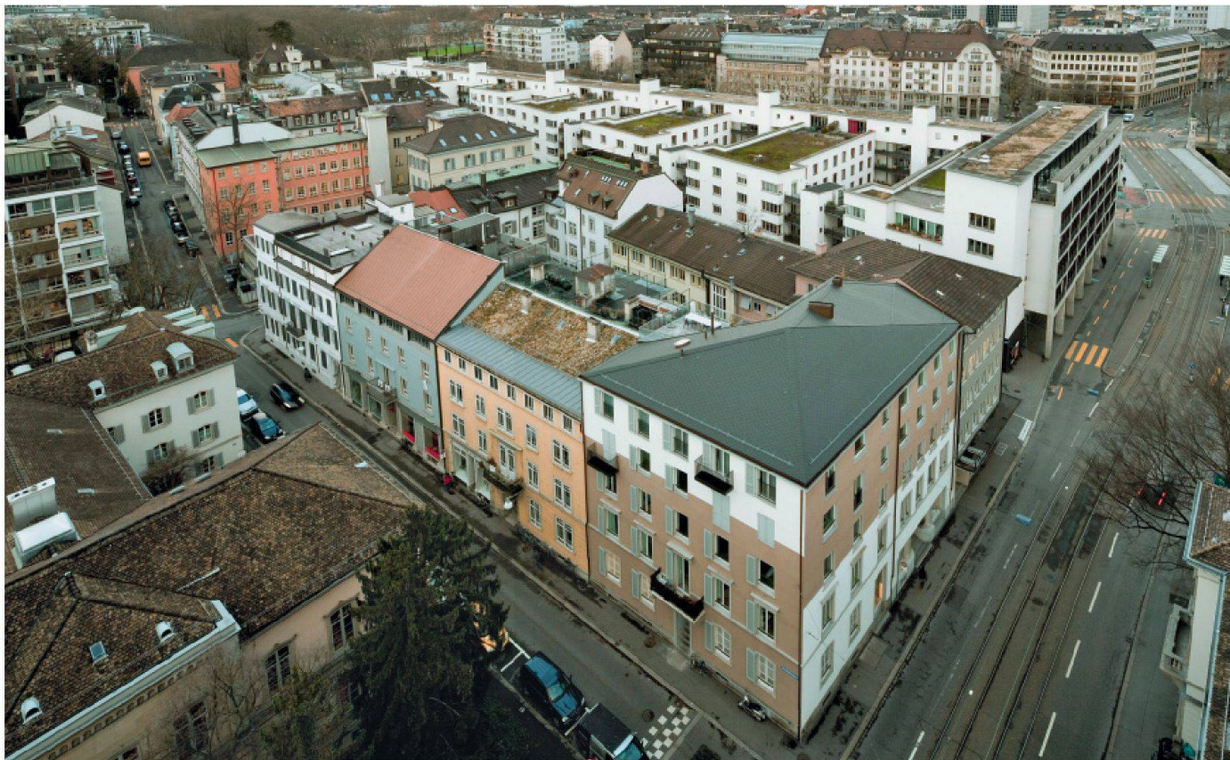
01 Residential and commercial building, Selnastrasse, Zurich (corner house)