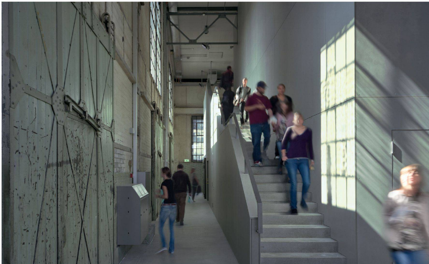
02 Production hall lecture building, University of Bern