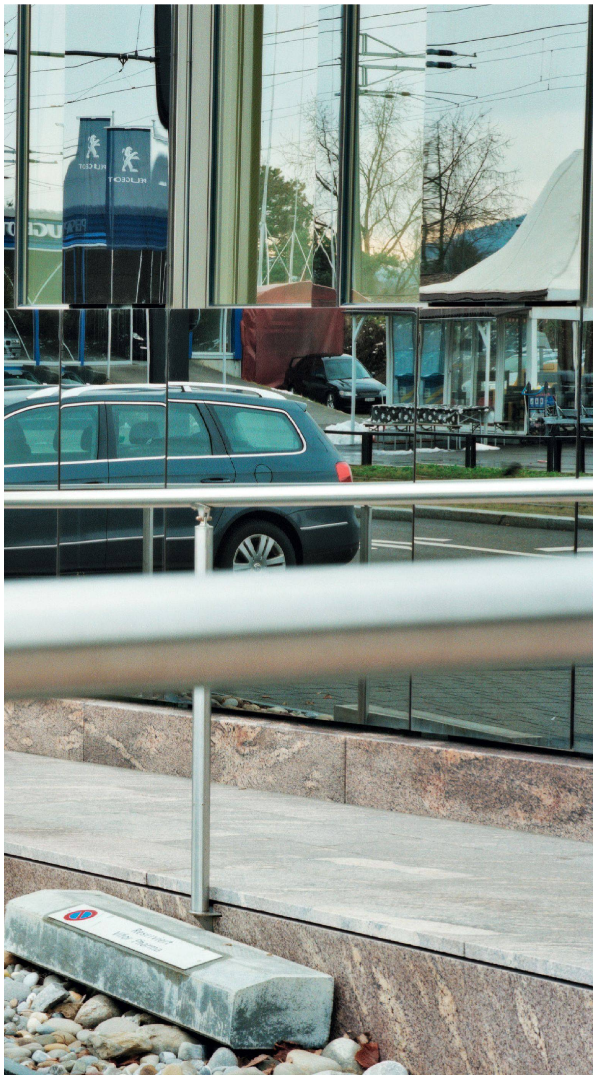
05 The Glattal tramway