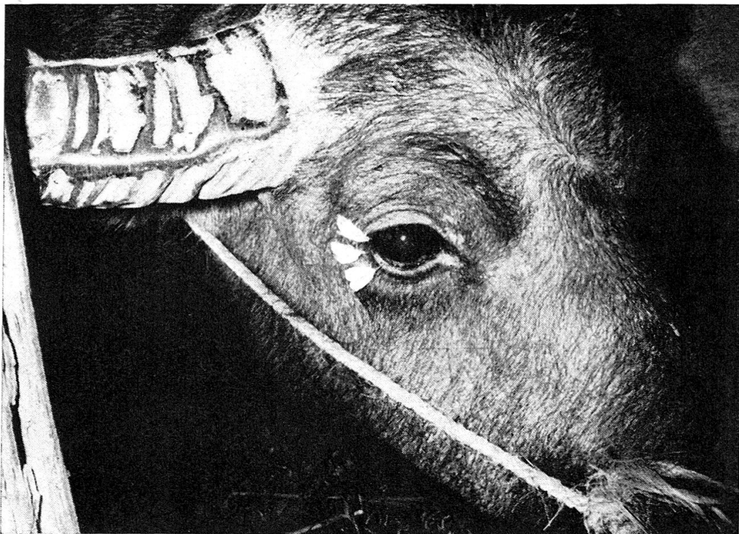
Fig. 2. — Lobocraspis griseifusa Hmps. on eye of domestic waterbuffalo as observed in Cambodia and Thailand.

Migration among insects is of by far of the greatest economic importance among the locusts. However, among the lepidoptera there are many migrants of economic significance (e.g. Agrotis ypsilon from Egypt to Europe, Alabama argillacea from S. or Central America to North America, Laphygma exempta from S. to Central Africa, Plusia gamma from S. to Central Europe, etc.).