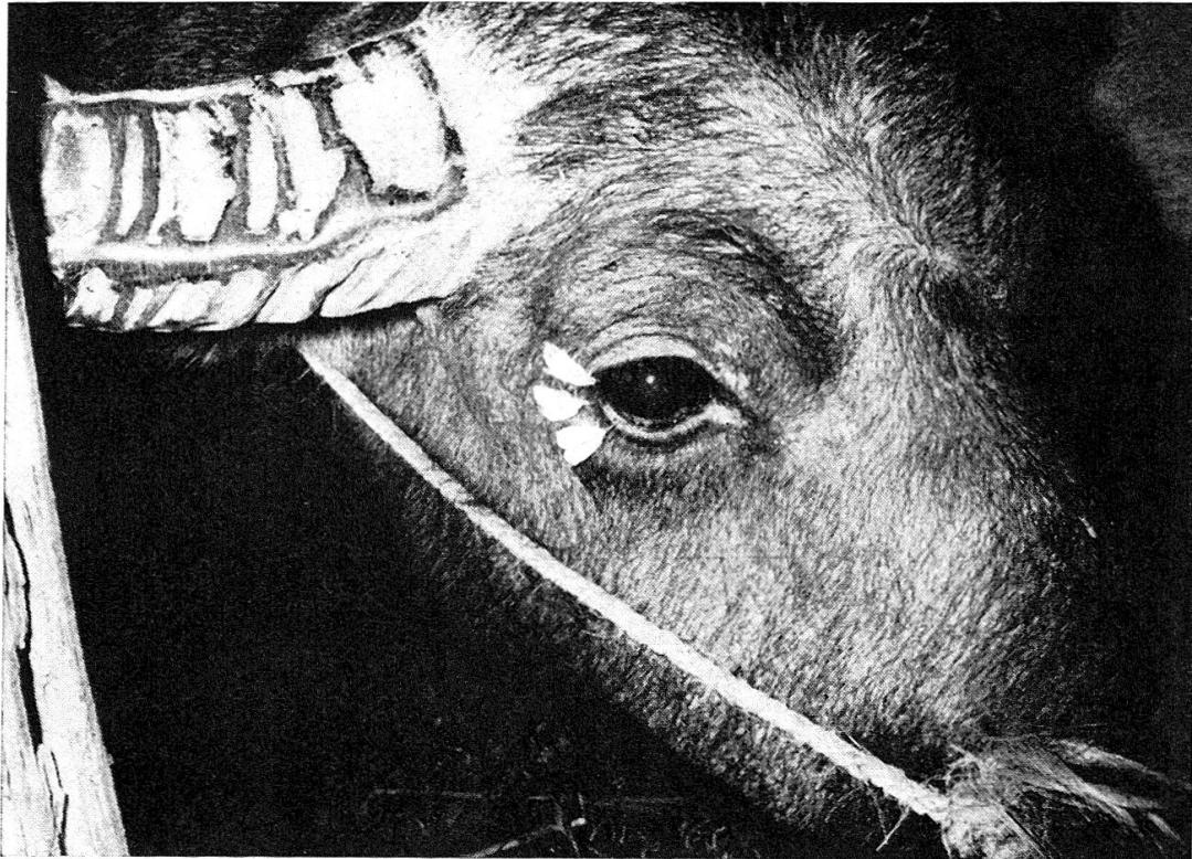
Fig. 2. — Lobocraspis griseifusa Hmps. on eye of domestic waterbuffalo as observed in Cambodia and Thailand.

Migration among insects is of by far of the greatest economic importance among the locusts. However, among the lepidoptera there are many migrants of economic significance (e.g. Agrotis ypsilon from Egypt to Europe, Alabama argillacea from S. or Central America to North America, Laphygma exempta from S. to Central Africa, Plusia gamma from S. to Central Europe, etc.).