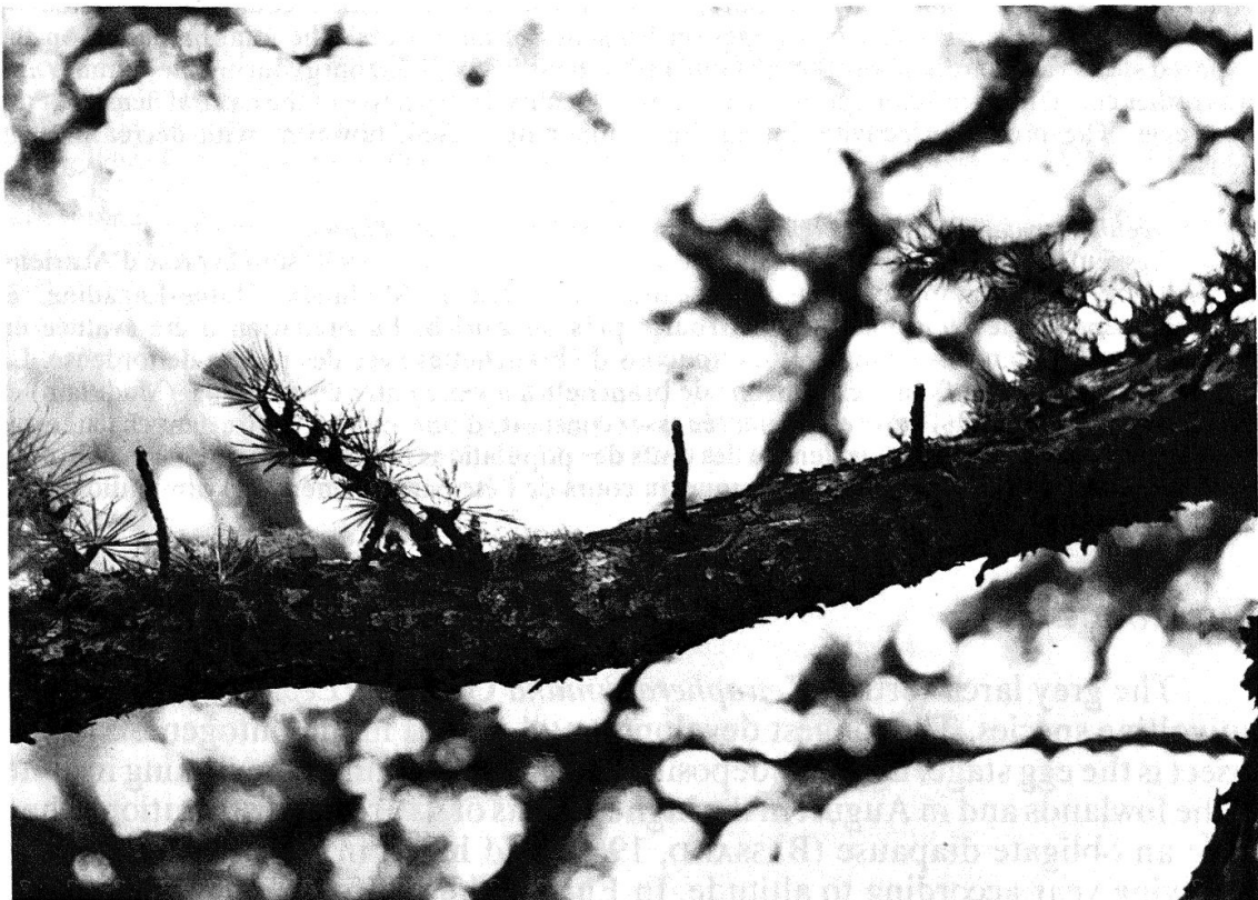
Fig. 1: Distribution of the sticks with eggs of Z. diniana on a larch branch.

the host and the existing mass rearing techniques for Trichogramma , the parasitoid was selected for utilization in mass release operations. In 1969 preliminary studies on the dispersal of the parasitoid were initiated in the Upper Engadine Valley. It appeared, however, that many exposed eggs were destroyed by predators during the summer months and that the action of the parasitoid might be nullified by the interference of predators. The role of predators in limiting Z. diniana populations in the egg stage was therefore studied during the three subsequent years, 1970–1972, in three localities – Zuoz and Madulain, 1800 m a. s. l., in the Upper Engadine Valley, and Lenzburg, 550 m a. s. l., about 30 km west of Zürich. In the experimental area at Zuoz visible damage occurs at every gradation of Z. diniana , in that of Madulain visible damage does not occur or is very limited (Dr. C. Auer, pers. comm. ).