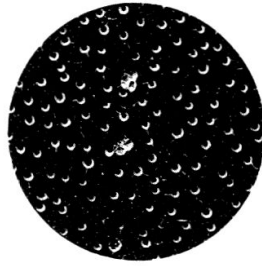
Fig. 1: Platambus punctatipennis n. sp., habitus.