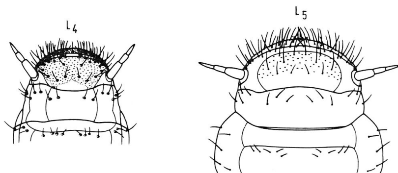
Fig. 3. Megalodontes klugi ; Anal segment of L 4 and L 5 , ventrally.

and V) in lateral view of the fourth and fifth instar, whereas Figs. 2 and 3 show the abdominal segment X (the anal lobe) from the dorsal and from the ventral side, respectively, also for the penultimate and ultimate larval instars.