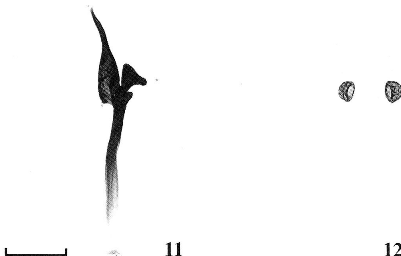
Fig. 11. Scaptomyza remota (WALKER), comb. nov., holotype ♂, aedeagus, aedeagal apodeme and parameres, left lateral view. 12. Drosophila melanogaster (holotype ♀ of junior synonym D. immatura WALKER), spermathecae. Bar = 200 \mu m.

Terminalia ♂ (figs. 2–11). Epandrium with one median bristle, micropubescent at upper posterior region. Cerci slightly fused to epandrium, ventrally partially fused to a pair of paralobes (FREY, 1954:28; HACKMAN, 1959:29) which distally bear a pair of long, stout, blunt, heavily sclerotized, rod-shaped bristles, preceded by a pair of short bristles plus a pair of longer bristles. Surstylus not micropubescent, crescent-shaped, dorsally wrinkled, laterally bearing 1 long bristle on upper surface, medially with about 11 short bristles on distal margin, ventrally with about 12 stout, incisor-shaped teeth, plus about 8 marginal bristles.