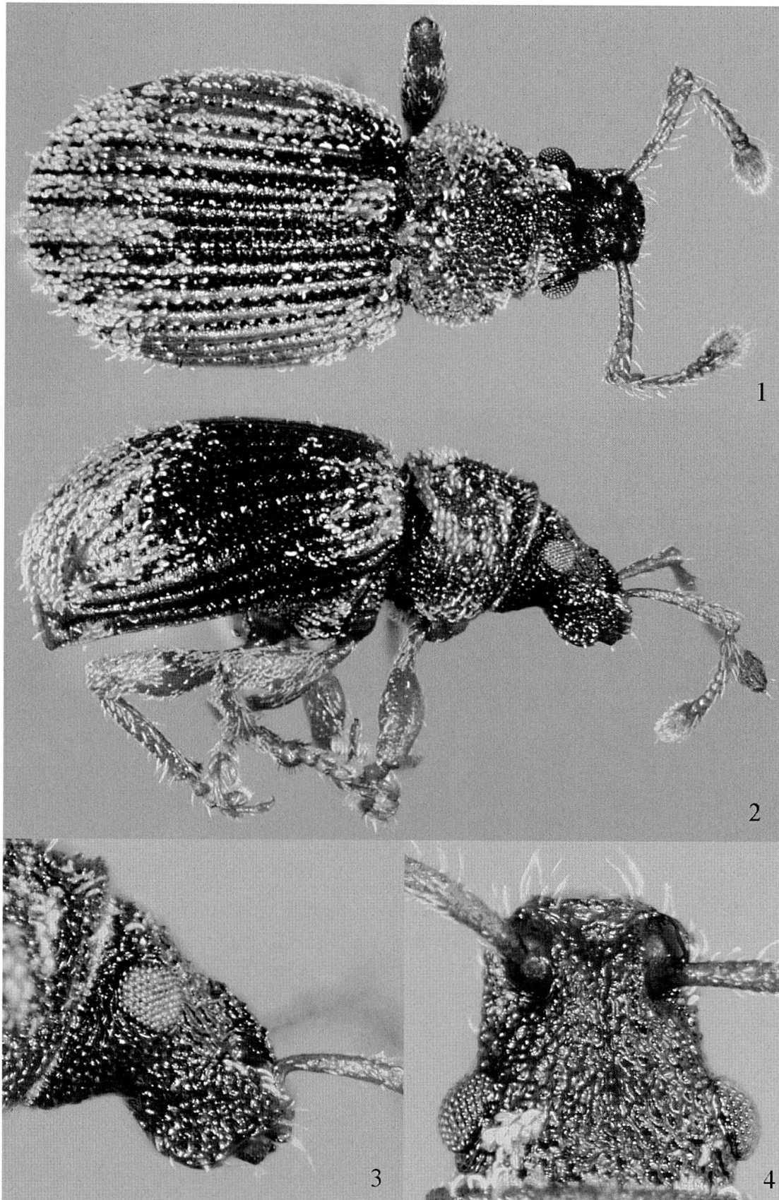
Figs 1–4. Amicromias tricholepis sp. n., male. (1) body dorsal view; (2) body lateral view; (3) head lateral view; (4) head dorsal view.