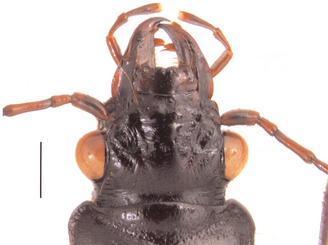
Fig 1: Head of Nebria (Patrobonebria) megalops sp. n. Scale bar: 1 mm.

The photographs were made with a digital camera Leica DFC 425, and the images were processed by the automated multifocus software (Imagic Image Access, Version 10).