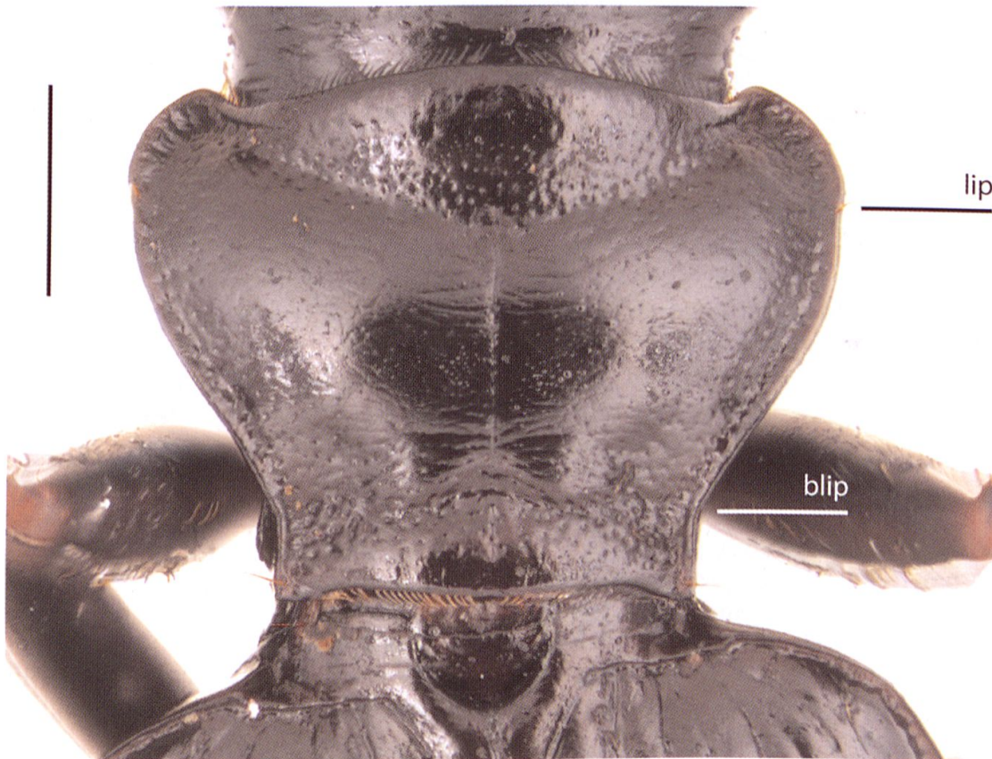
Fig 2: Pronotum of Nebria (Patrobonebria) megalops sp. n. lip: lateral impression of the pronotum; blip: basolateral impression of the pronotum. Scale bar: 1 mm.

punctate. Hemispheric eyes very prominent. Temples long, regularly rounded towards the neck. Antennae long and slender, extending to the middle of the elytra. Antennal scape subcylindrical, basally narrowed, shorter than the eye's diameter, with 1 dorsal seta (rarely bisetose). 4th antennomere only with an apical collar of long setae and only few additional short setae. Ligula blunt with 2 long setae apically. Maxillary stipes basolaterally with 5–7 robust setae. Penultimate labial palpomere bisetose. Mentum with bifid medial tooth. Submentum with a row of 4–8 setae. Microsculpture of the head isodiametric.