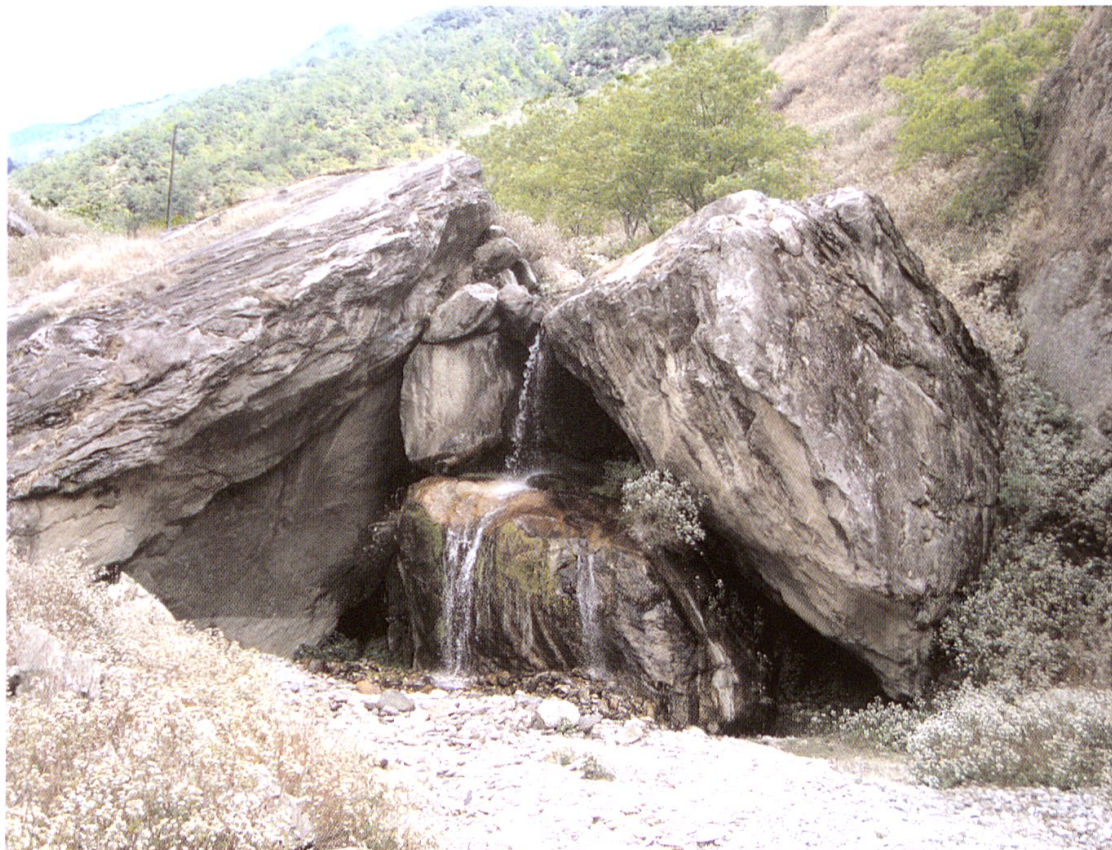
Fig 4: Habitat of Nebria (Patrobonebria) megalops sp. n. near Da Po Qing village near Dali/Yunnan (China).