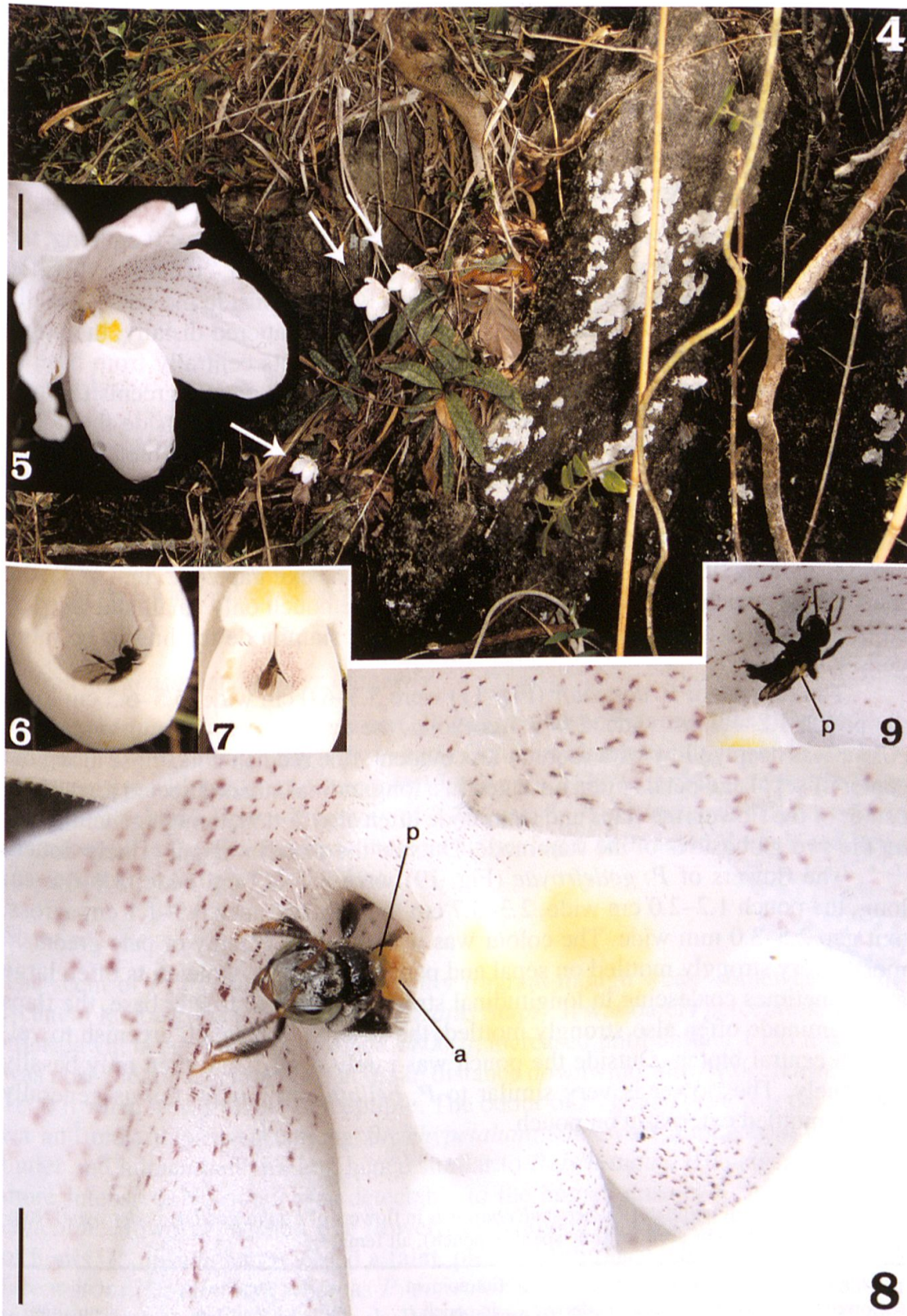
Figs 4–5. Paphiopedilum niveum . — 4, three flowering plants (arrows) in typical habitat; — 5, detail of flower; bar=10 mm. — Figs 6–9. Worker meliponine bee Tetragonula testaceitarsis entrapped in P. niveum . — 6, at pouch bottom; — 7, climbing up «tunnel»; — 8, squeezing itself out of the exit while acquiring a pollen smear; — 9, leaving with a small yellow smear on thorax; a=anther, p=pollen, bar=2 mm.