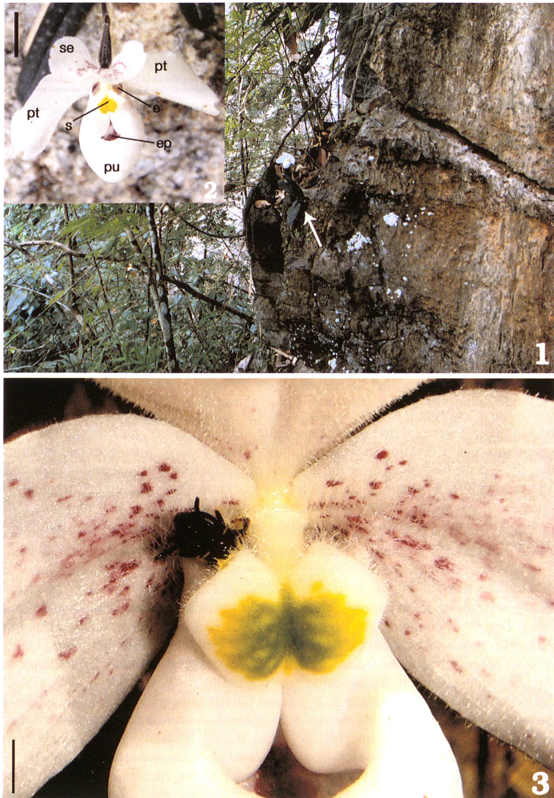
Figs 1–3. Paphiopedilum thaianum . — 1, flowering plant (arrow) in typical habitat; — 2, detail of flower; note large blotches inside pouch which distinguish it from P. niveum ; e=exit, ep=entrance of pouch, pu=pouch, pt=petals, s=staminode, se=sepal, bar=10 mm; — 3, female halictid bee Lasio-glossum orchidodeceptum squeezing itself out of the narrow exit, thereby acquiring a pollen smear; bar=2 mm. Figs 1–16 show natural events in original habitat.