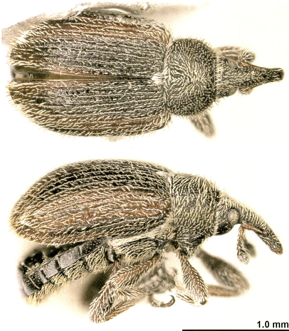
Fig. 1. Habitus (dorsal, lateral) of the adventive Gymnetron rotundicolle Gyllenhal, 1838, canton Ticino, Porza. The photos were taken using the VHX-2000 photograph system version 2.2.3.2. (Keyence Corporation) at the NMBE.

Lombardia: Monguzzo (Como), 31.3.2012, leg. & coll. L. Diotti; 3 males, 2 females, Lago di Alserio (Como), 2.6.2012, leg. & coll. L. Diotti; 2 males, 3 females, Emilia Romagna, Varano (Parma), 12.11.2010, leg. & coll. L. Diotti; 1 male, Umbria: Monte Martano, Giano dell'Umbria (Perugia), 700–900 m a.s.l., 25.5.2012, leg. & coll. A. Paladini.