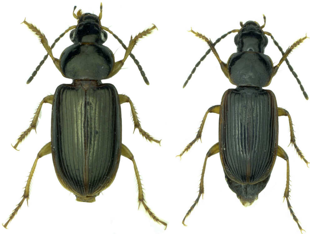
Fig. 1. Habitus of a male individual of S. marginatus (from Mendrisio TI, 12.VIII.2015, 5.4 mm), left, and of a male individual of S. mixtus (from Gy GE, 06.III.2015, 4.9 mm), right.

The first individual of S. marginatus was found under a clump of earth at the bottom of a furrow in a cornfield in southern Ticino. Following this discovery, the area was revisited two months later. Several other specimens were then found. All were under plant remains (grass cuttings) on bare soil (tractor trenches, mounds of earth) bordering cropland (Fig. 2). The substrate was slightly moist, while surrounding areas not covered by grass cuttings were dry.