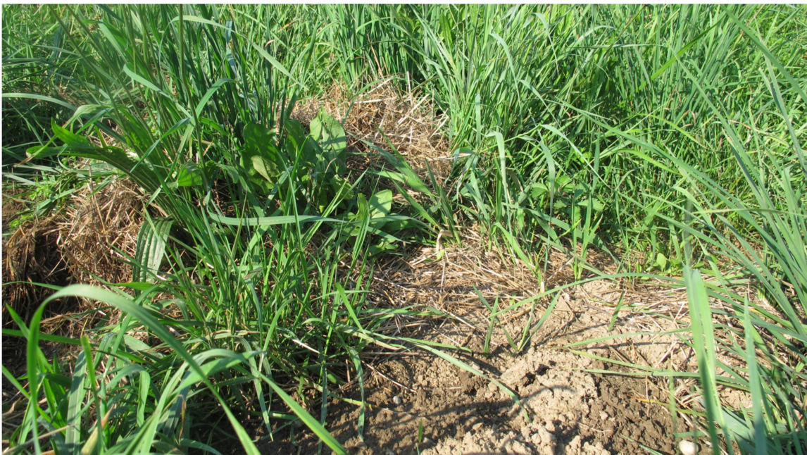
Fig. 2. Habitat of S. marginatus . All individuals were found on bare soil (tractor furrows, above; heaps of earth in the middle of a field, below) covered with plant remains (grass cuttings).