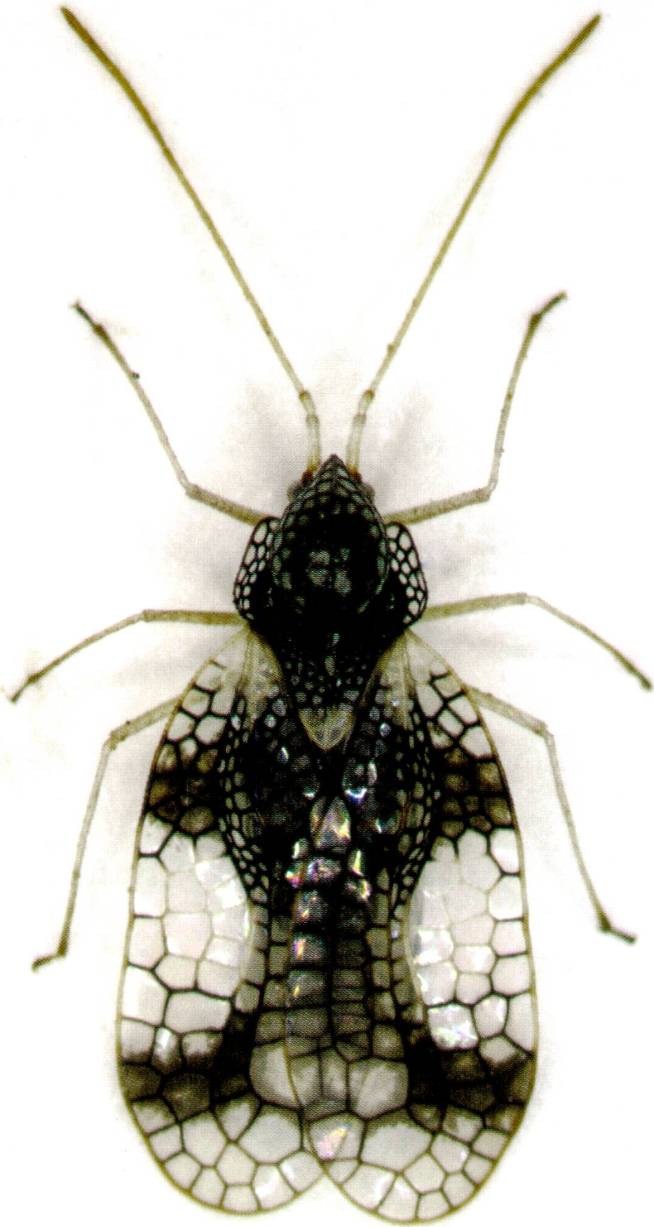
Fig. 1. A male Stephanitis takeyai (Drake & Maa, 1955) from Zurich sampled during the BetterGardens arthropod survey. The body-length is slightly below 4 mm. The main difference to European species of the genus is the larger and more rounded neck bubble.