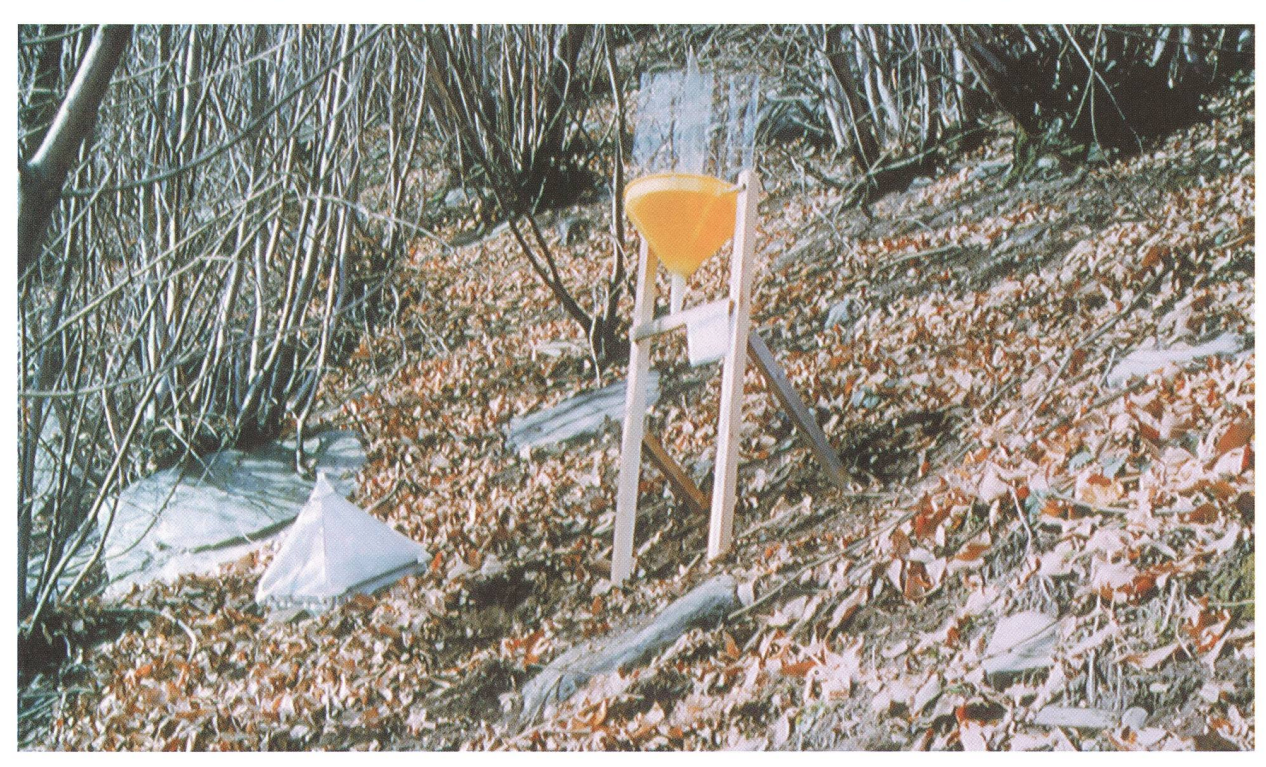
Figure 6. Combi trap in an intensely disturbed forest plot in Ticino (Forest fire I) after several forest fires within the previous 40 years. In spring the chestnut regrowth (here without old trees) is still without leaves.