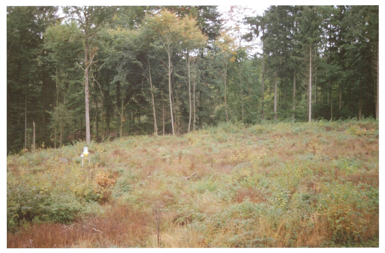
Figure 5. Cleared windthrow plot in mixed forest near Messen, two years after storm Lothar (Windthrow II).

forest; FO). All plots had similar site conditions. The same combi-traps (Fig. 6) as in windthrow project II (Lothar) were used (Moretti et al. 2006). Three traps were placed in each of the 54 plots. The minimum distance between traps at each site was ten m, while the average distance between the sites was around 300 m. The traps were emptied week-ly from March to September 1997.