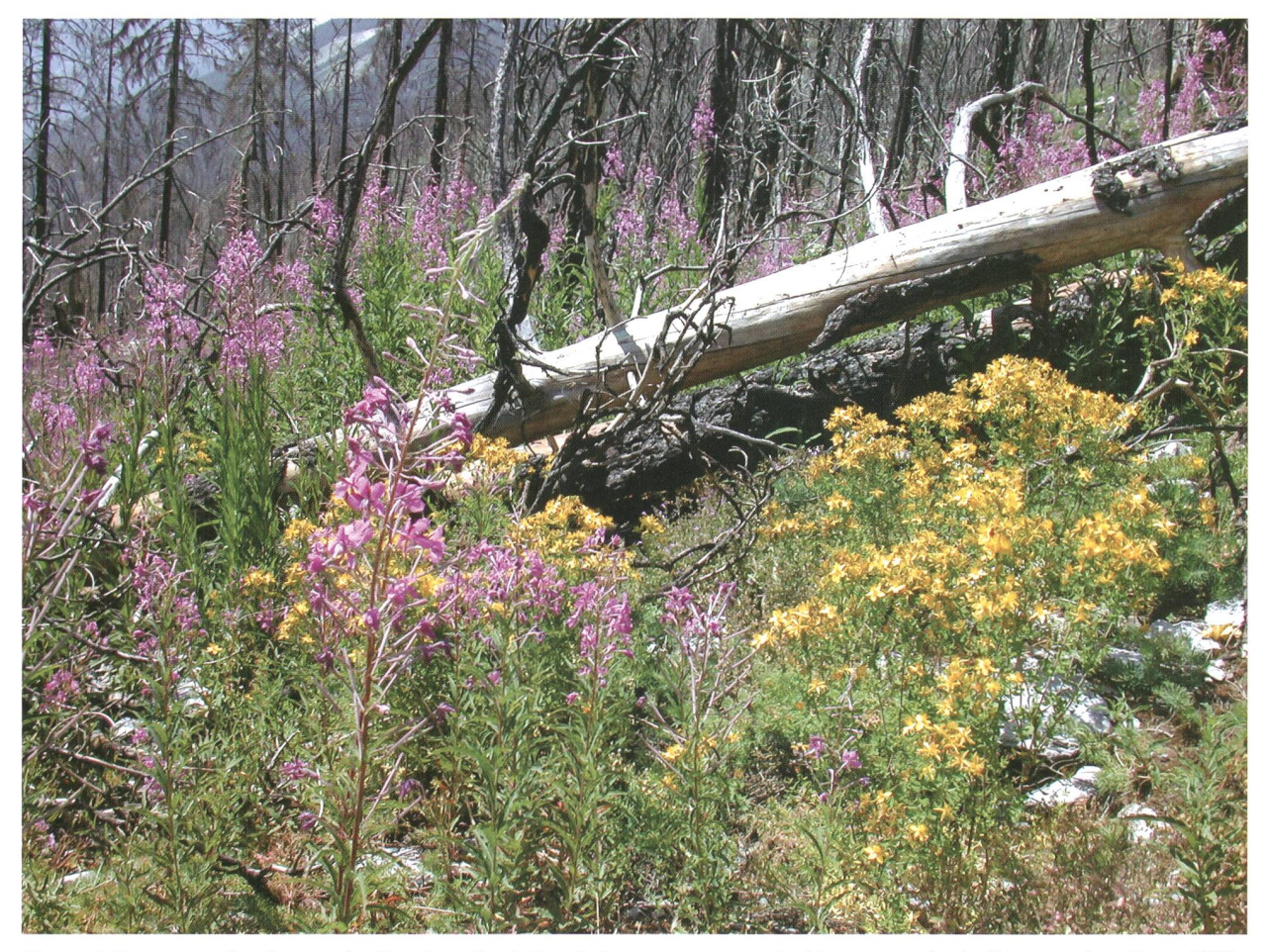
Figure 8. Two years after the massive fire above Leuk the whole area was covered with a carpet of colorful vegetation.

To quantify the positive or negative impact of disturbance on a species, the numbers were combined separately for the three treatments FO, ID, and HD for all four projects. The number of trap sites per treatment was balanced. As an indicator for the effect of disturbance in general, the following formula was used for each species: mean (HD+ID) / (mean (HD+ID) +FO). Species with more than 66% are considered winners, those with less than 33% losers.