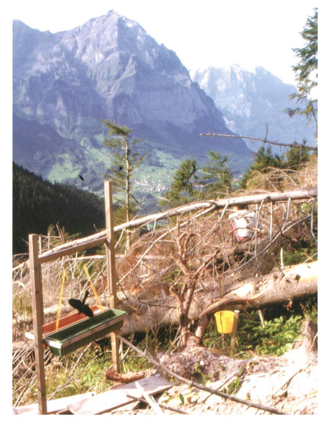
Figure 1. Window interception trap and yellow bucket trap in an uncleared windthrow plot (Windthrow I) above Schwanden after storm Vivian.

In early 1990 storm Vivian devastated mainly subalpine spruce forests in the Swiss Alps (Fig. 3). Near the village Schwanden at elevations around 1000 m three forest