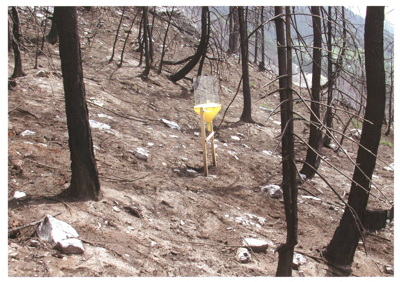
Figure 7. Combi trap in the center of the large burned area above Leuk, a few months after the fire (Forest fire II).