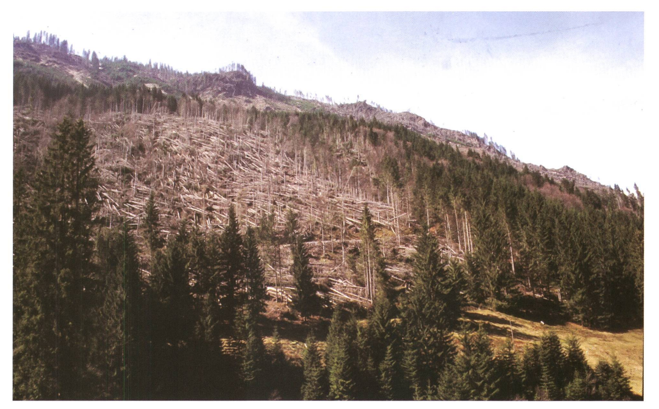
Figure 3. Large windthrow of storm Vivian in spruce forest in the Canton Glarus.