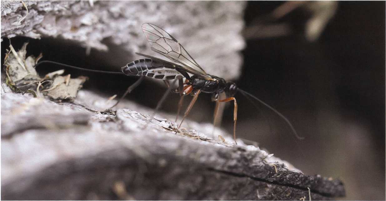
Figure 1. Xorides ater female. Freshly eclosed female resting on a Picea abies woodpile in the Swiss Canton of Bern.