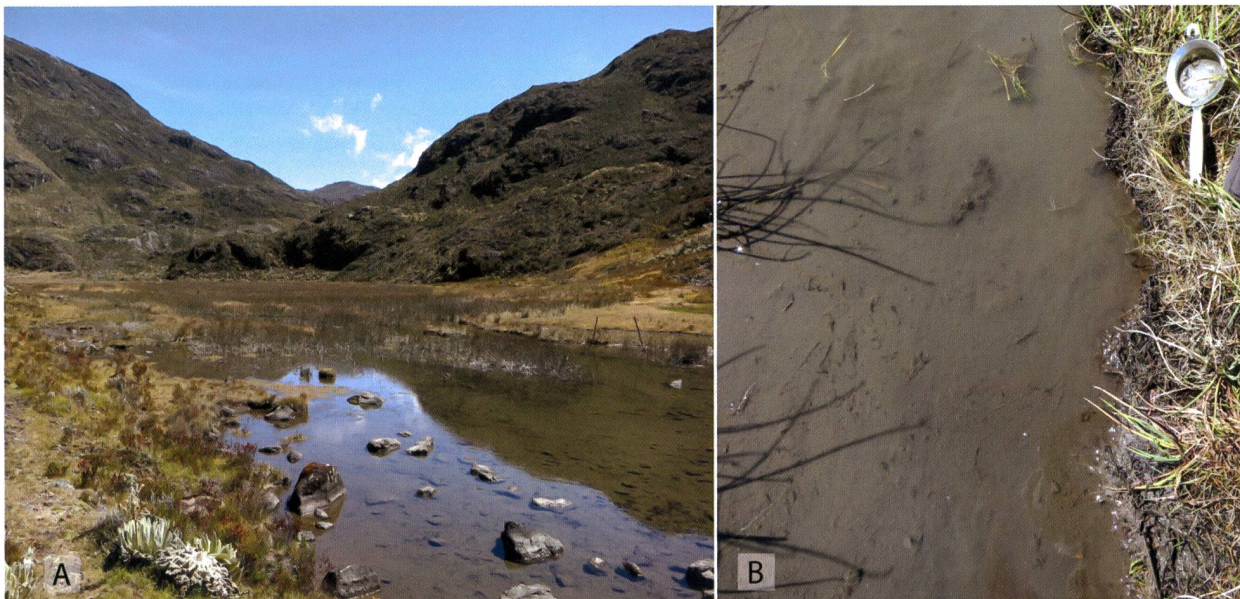
Figure 4. Habitat of Liodessus spp. nov. near Gavidia, Venezuela, where both new species were collected (collecting event VZ10-0123-03A). Overview (A); detail of shallow water at the edge (B).

Structures. Antenna stout. Head with occipital line; with rounded clypeus. Pronotum with distinct lateral beads; with distinct long and deep basal striae (Figs 1A, B). Elytron with short basal stria; without sutural line; without basal epipleural transverse carina. Metathoracic wings not examined in holotype (in paratype: short, about half the length of elytron).