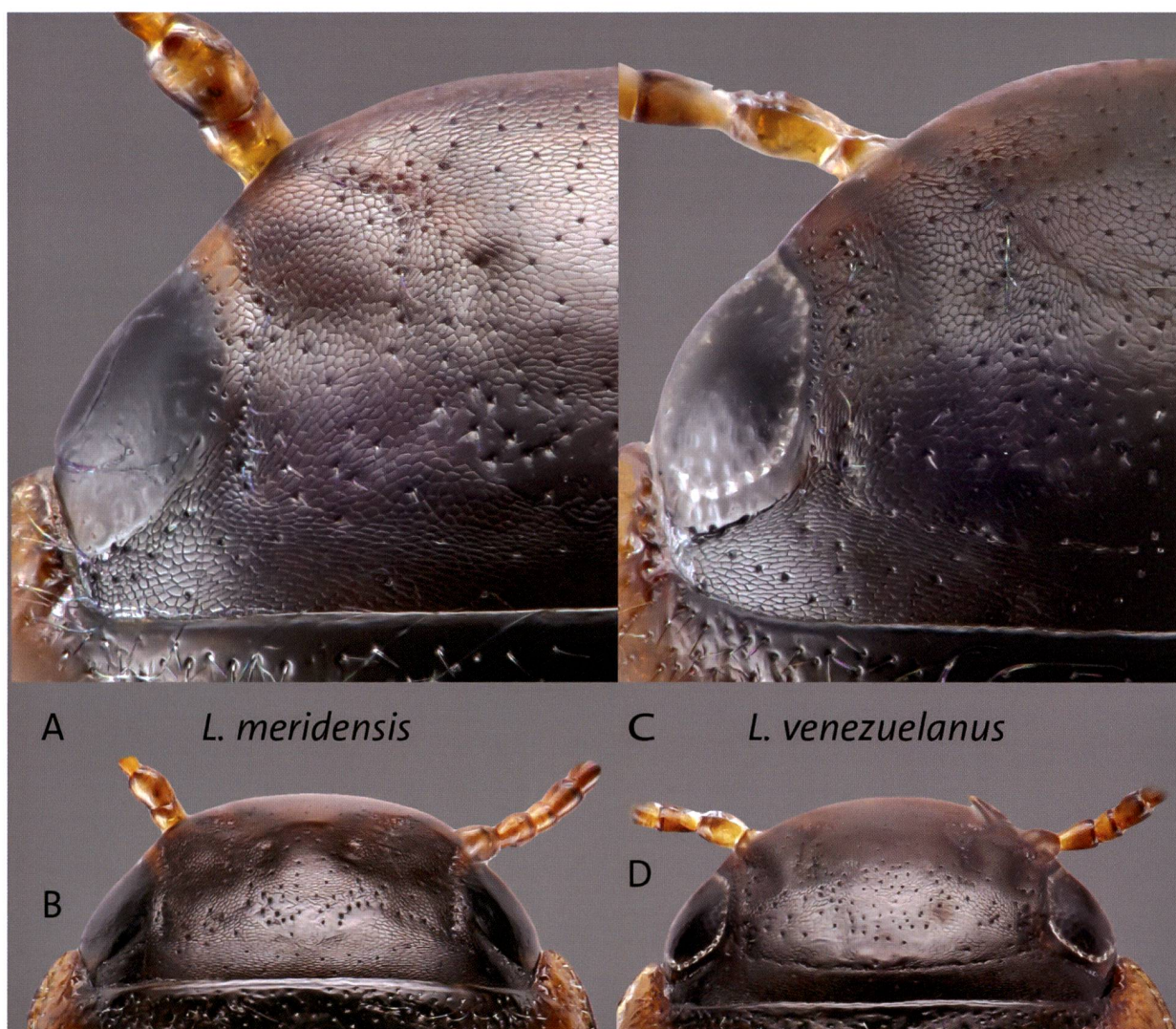
Figure 2. Liodessus spp. nov. Detail of head in dorsal view. L. meridensis (A, B); L. venezuelanus (C, D).

Comparative notes. Distinguished from the other species of Liodessus by the diagnostic combination of the following features: Species from Venezuela; beetle smaller (TL 2.1–2.3 mm); very dark brown to blackish; head without occipital line; pronotal and elytral striae present; wings reduced considerably; shape of median lobe (narrow and “pointed” in lateral and ventral view, with its particular shape).