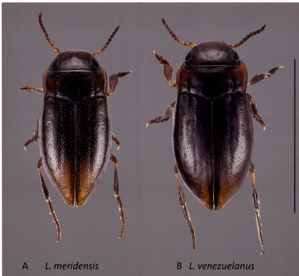
Figure 1. Dorsal habitus of Liodessus spp. nov. L. meridensis (A); L. venezuelanus (B). Scale bar: 2 mm.

Type material. Holotype: Male: Venezuela; Mérida, Laguna de Mucabají, 3,500 m, i.2004, 8.7964, -70.8255, García & Balke (MIZA). Paratypes: 13 exs same label data as holotype (MIZA, ZSM); 47 exs Venezuela: Mérida, ca. 5 km E Gavidia, 3,600 m, 23.I.2012, 8.6895,