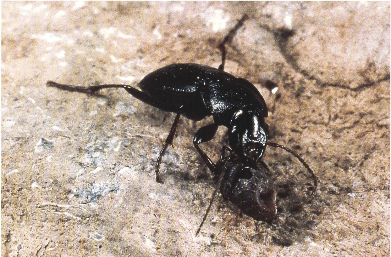
Figure 3. The predatory beetle Licinus depressus interrupts the opening process of the shell and begins to feed on the soft tissue of the prey snail.