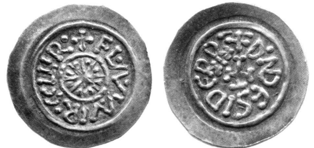
Fig. 3 (2:1).

Vercelli tremisiss published in the auction catalogue, probably struck by Desiderius in 773–774