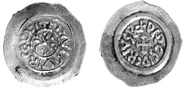
Fig. 2 (2:1).

Vercelli tremisiss of the Ilanz cache probably struck by Desiderius in 773–774. Obv.: +FL·AVIAVIRCC·L·L·I, (AV ligatured), four-ray star with olives within sectors, four pellets between the main axis 12 of the coin and the olives. Rev.: +DNDCSIDCRIVS R x (ND and RX ligatured), a potent cross (with lunettes).