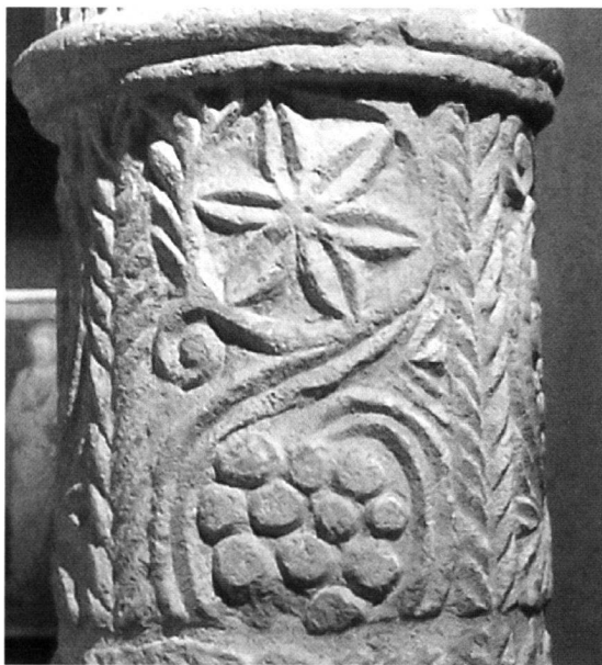
Fig. 5: A six-ray star pattern on a capital, Santa Giulia Museum, Brescia, Italy.

The six-ray star tremisses of Desiderius represent a traditional Lombardic pattern, as is also precisely documented by Pardi 15 , who demonstrates that the six-ray star is largely used as a decorative element in stuccos, plutei and fibula belts of the Lombardic period (see a detail of a column capital in fig. 5).