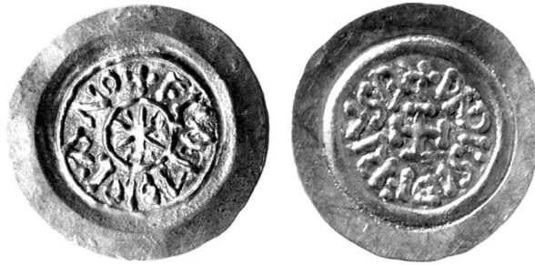
Fig. 1 (2:1).

Milan tremissis of Desiderius struck up to 772/3: a traditional pattern.