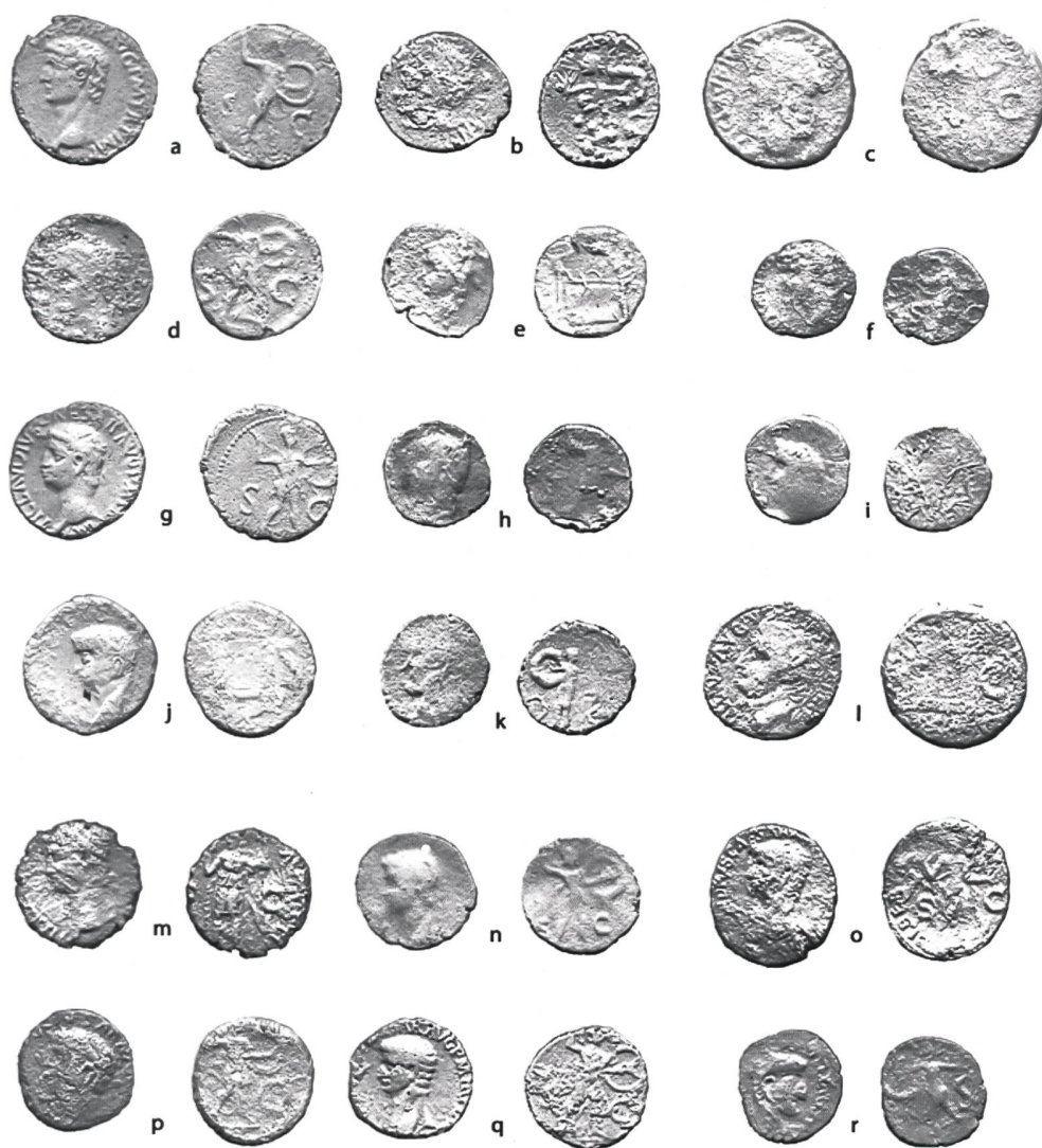
Pl. 1: Selection of imitations from the Martberg

Photos of a selection of 18 analyzed imitations from the Martberg are shown in plate 1.