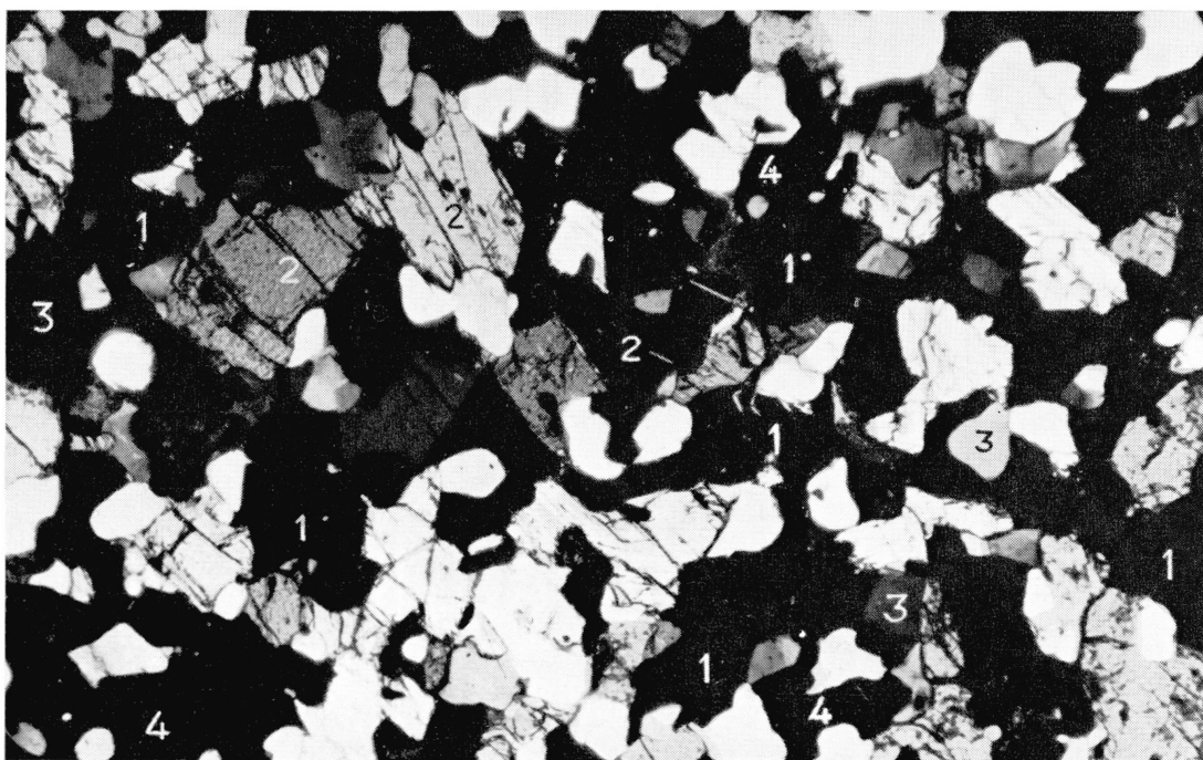
Fig. 2. Amphibolite containing isotropic unknown mineral N of Belihun, Sierra Leone. Thin section 40\times . N + . 1 = dixeyite; 2 = hornblende; 3 = quartz; 4 = magnetite.