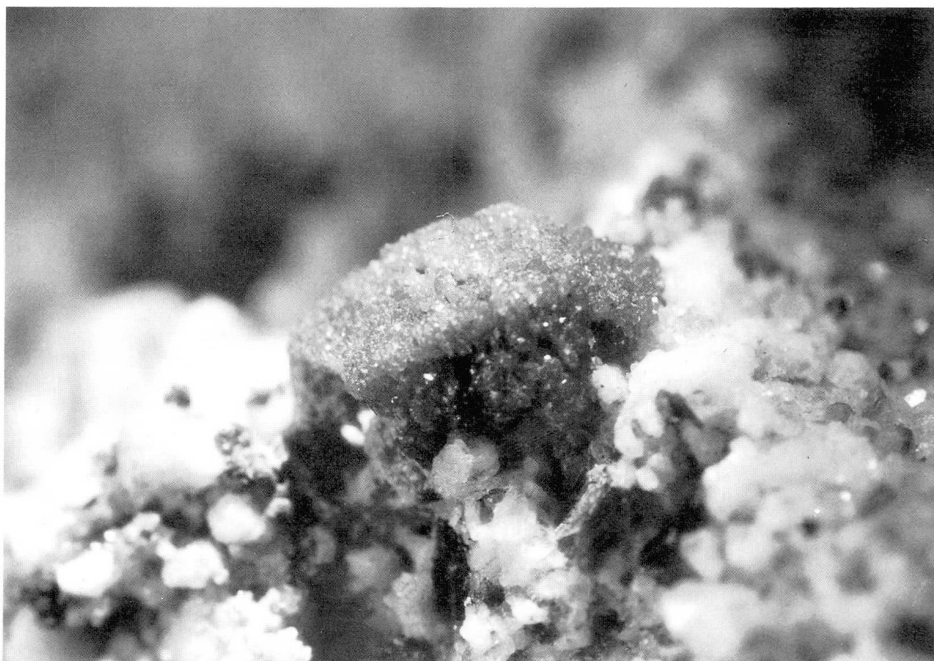
Fig. 1 Pseudomorph of gasparite after barrel-shaped synchisite (length 5–6 mm) (Foto E. Offermann).

Pizzo Cervandone (in Italian) or Cherbadung (in local Swiss dialect) is a remarkable mountain peak between V. Devero in Italy and Binntal in Switzerland. The whole region belongs to the Penninic Mte.-Leone nappe, consisting partly of meta-sediments together with predominant gneisses which were influenced by lower amphibolite zone metamorphism: the mesocoic meta-sediments are partly kyanite-bearing. As the nappe has an almost horizontal position, the geological situation is more or less identical on both sides of the border. The formation of fissure minerals in the whole region has been strongly influenced by the remobilisation process of hercynic Cu-As-ores (tennantite, chalcopyrite) during Alpine metamorphism. These migrating arsenic bearing solutions resulted in the generation of a large number of highly special minerals, mainly arsenate and arsenite minerals (GRAESER, 1966; GRAESER and ROGGIANI,