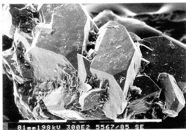
Fig. 3 SEM-picture of ideally shaped gasparite crystals (Foto: SEM laboratory University Basel).