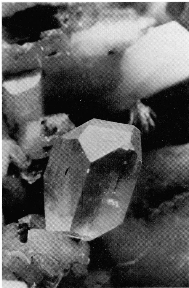
Fig. 1 Euclase crystal from Pizzo Giubine ( \times 15 ).

A crystal measuring 0.07 \times 0.10 \times 0.12 mm was mounted on an Enraf-Nonius CAD-4 diffractometer, and twenty-five intense reflections having a \Theta value in the range 11.3 – 20.3^\circ were centered using graphite-monochromated \text{MoK}\alpha radiation ( \lambda = 0.71073 Å). The unit-cell parameters were obtained by refinement of their setting angles,