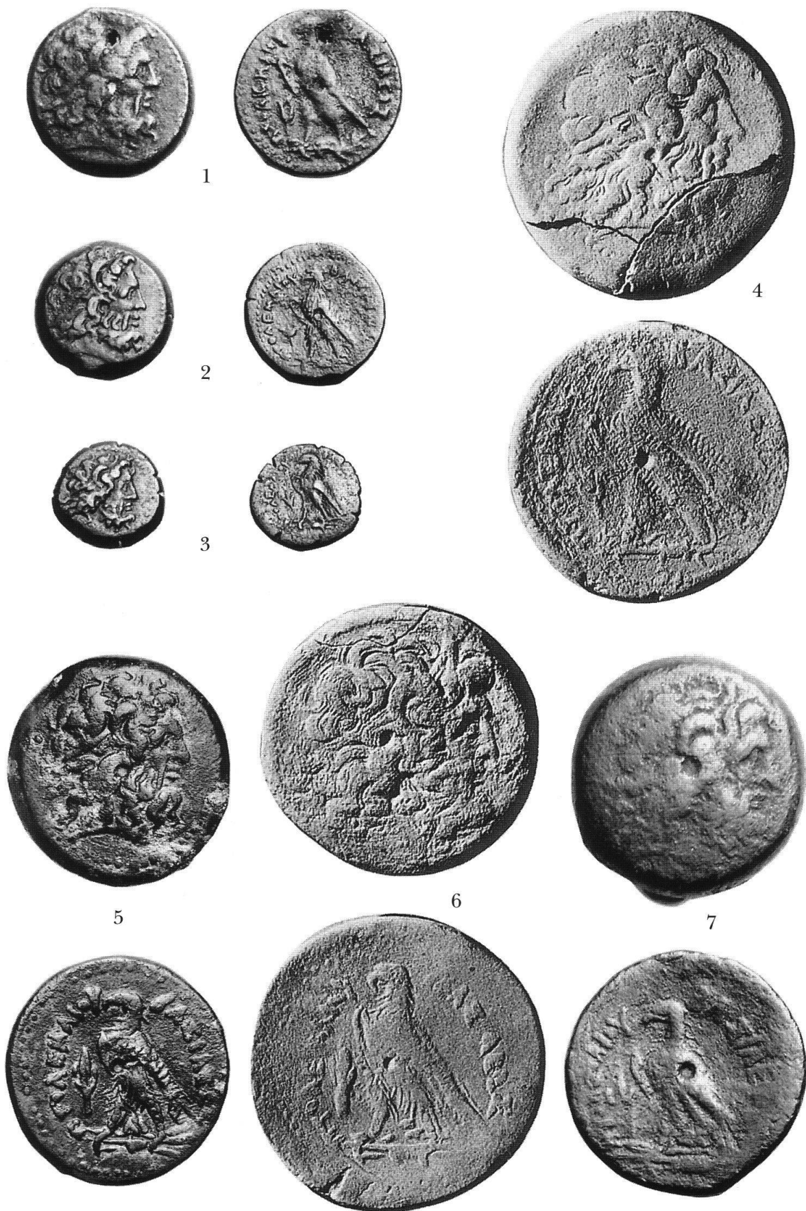
Catharine Lorber, The Lotus of Aphrodite on Ptolemaic Bronzes (1)