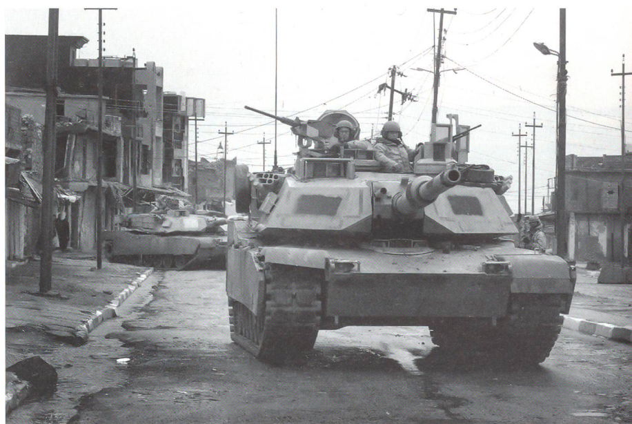
A M1-A1 Abrams tank of the 3rd Armoured Cavalry Regiment moves through the streets of Mosul, Iraq. As part of their global commitment, the United States invaded the country in 2003 to free its population from Saddam Hussein's regime.

In the long run, many see China's re-emergence as a global power as offering an alternative to diminishing American clout. Even if such a linear transition between great powers were to take place, and assum-