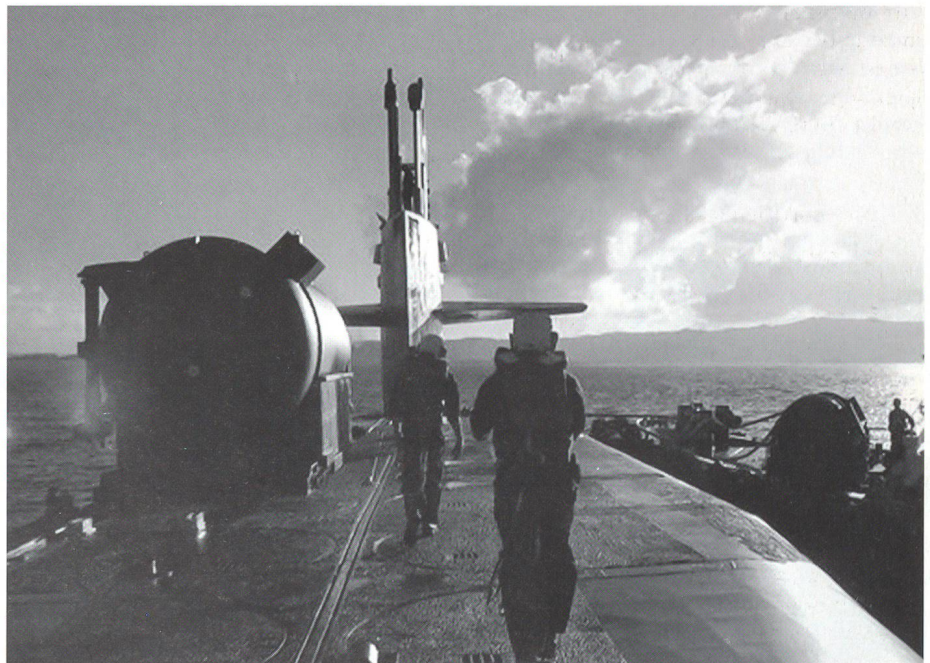
Four former strategic ballistic missile submarines of the Ohio-class were recently converted to cruise-missile and Special Operation Forces carriers. They each have 154 Tomahawk cruise missiles aboard and thus offer a unique strike power to the operational U.S. commanders worldwide.