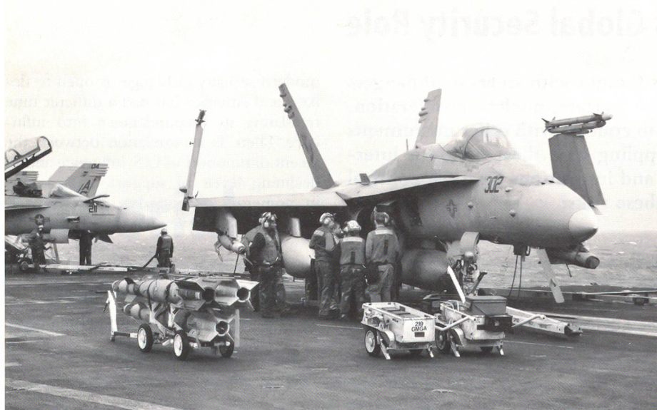
Aircraft carriers are important assets in the United State's global security role. This F/A-18 C of Strike Fighter Squadron 37 belongs to the carrier USS Harry S. Truman currently conducting maritime security operations in the Persian Gulf.