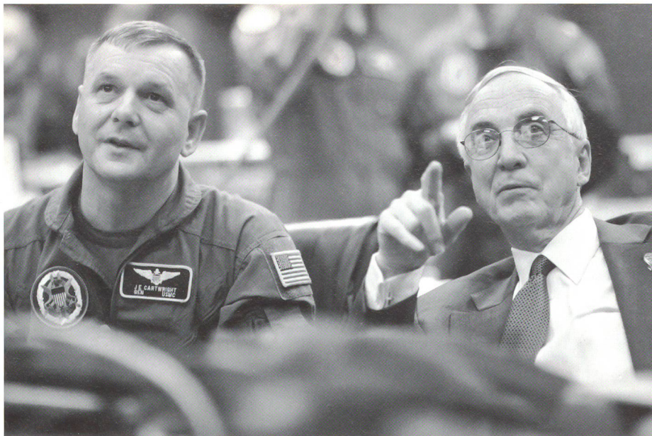
Deputy Secretary of Defense Gordon England (right) and Marine General James E. Cartwright, Vice-Chairman Joint Chiefs of Staff, watch the successful kill of a satellite from the Command Center at the Pentagon in February 2008. The Standard sea-to-air missile SM-3 was fired from the cruiser USS Lake Erie.

Maritime forces from the United States Navy and Coast Guard (such as these vessels in Bahrain), together with forces from the UK, Australia, France, Pakistan, Germany and others, control the Persian Gulf in order to protect Iraqi oil terminals from terrorist attacks.