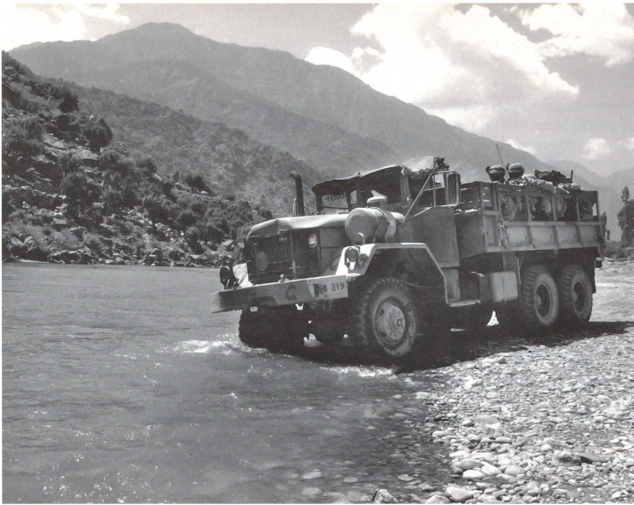
A short time after 9/11 the United States sent military forces into Afghanistan to fight at one source of terrorism. Here members of C Company, 1st/32 Battalion, 10th Mountain Division are crossing the Pech River during a mission in Afghanistan.