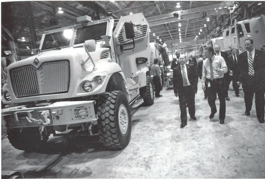
The US armed forces often suffer heavy casualties from mine blasts in Iraq. To reduce the risks during life threatening patrols, the Army is now deploying the new vehicle MRAP which offers much better protection to the crew.

ing that China increasingly comes to share Western values embodied in the Enlightenment, certainly for the foreseeable future China is not close to seeking, accepting or receiving the mantle of global leadership on security matters. Its pretensions to global military power remain mostly external interpretations of where China may be heading in the future rather than any declared aspiration on the part of the Chinese Communist Party. China's meteoric rise since Deng Xiaoping opened up China in 1978 has produced impressive economic growth, but progress has also exposed a host of domestic threats from environmental, social, and political causes.