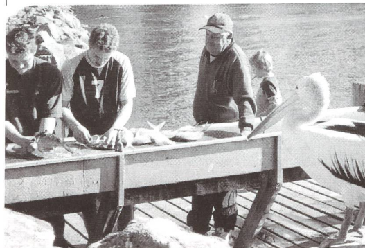
Die Pelikane haben offenbar Hunger