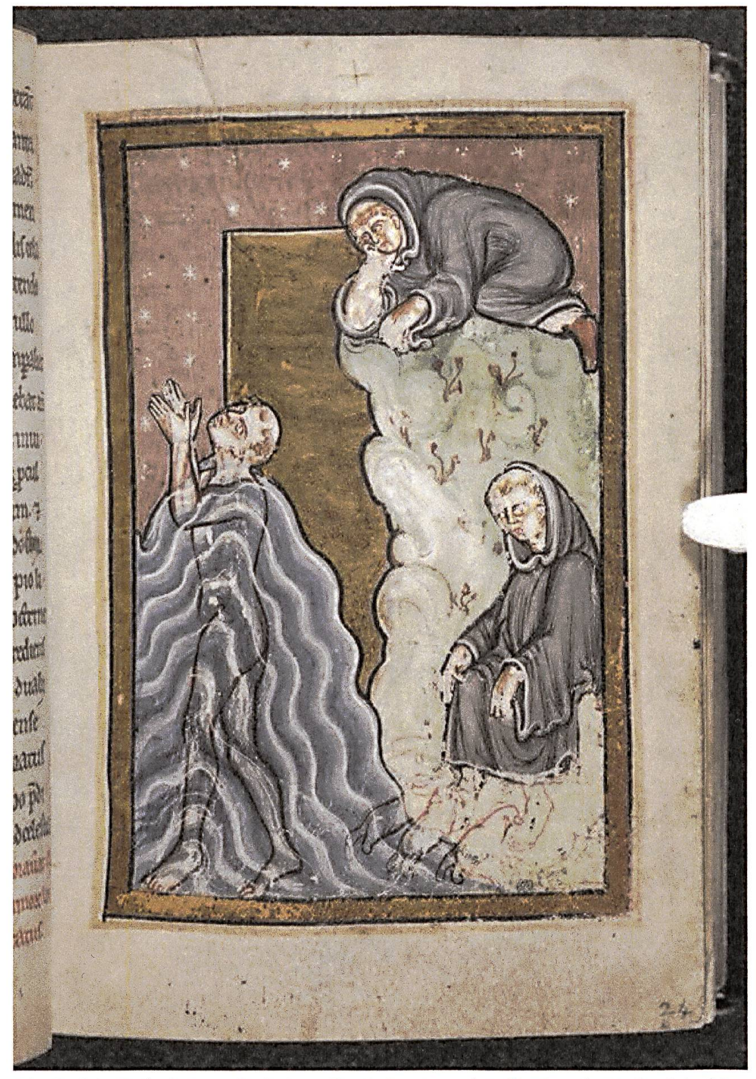
B): Carlisle Cathedral north choir stall paintings, panel 9.