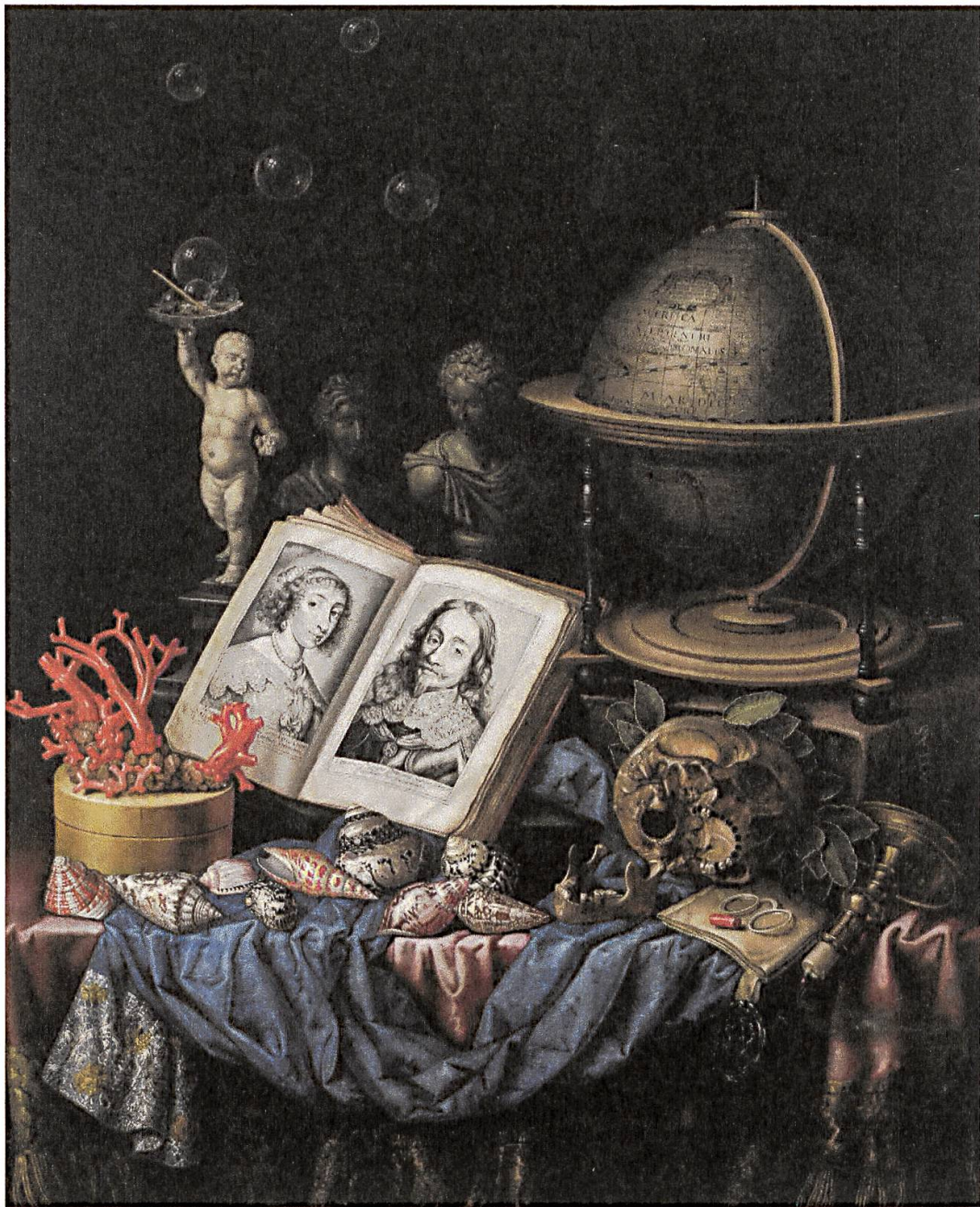
Figure 1: Carstian Luyckx (1623-c.1675), Allegory of Charles I of England and Henrietta of France in a Vanitas Still Life , oil on canvas, 57½ x 47¼ in. (146.1 x 120 cm). Birmingham Museum of Art, inv. no. 1988.28.

The execution of King Charles I of England on 30 January 1649 struck a powerful blow, at home and abroad, against a political establishment predicated upon the divine right of kings. For royalists in England, as for the European ruling classes, it was profoundly shocking – in a way that rocked their whole sense of world order – that a king, anointed by God, could be thus struck down. The profound mark that this event left