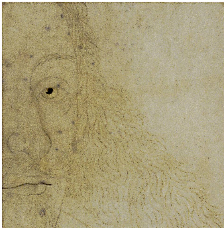
Figure 5: Anon., Portrait of King Charles I of England, brown ink and metalpoint on parchment, blue pigment and shell gold. St. John's College, Oxford. Detail of the lines of face and hair.

drawing. 3 John Evelyn, who visited the college library in July 1654, mentioned several of the college's curiosities, but not the portrait (Evelyn, Diary 3, 108). 4 The earliest reference to the drawing comes in July 1662, in the journal of the Dutchman William Schellinks, which provides a useful description of its context: