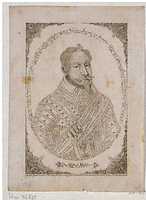
Figure 10: Johann Michael Püchler the Younger, Micrographic Portrait of Gustavus Adolfus, King of Sweden, engraving, 20 x 14.7 cm, Berlin, Kupferstichkabinett, Staatliche Museen zu Berlin, Inv. No. 304-125. Reproduced by kind permission.

Wells's "enshrined luster" suggests another possible meaning intended in the use of the technique. As Leila Avrin has written of Jewish micrographic images, "the scribe was intent on inducing the cerebral condition of alexia, the inability to read the written words . . . the letters seem to melt before one's eyes" (Sirat and Avrin 51). In the Charles I portrait, too, the letters, even in their original, less faded state, would have been barely legible and, as Wells's poem implies, would have functioned more as a vehicle of mystical identification and contemplation. The physical words, in their illegibility, act as a material signifier of an invisible divinity. The various near-contemporary accounts of the portrait of Charles I