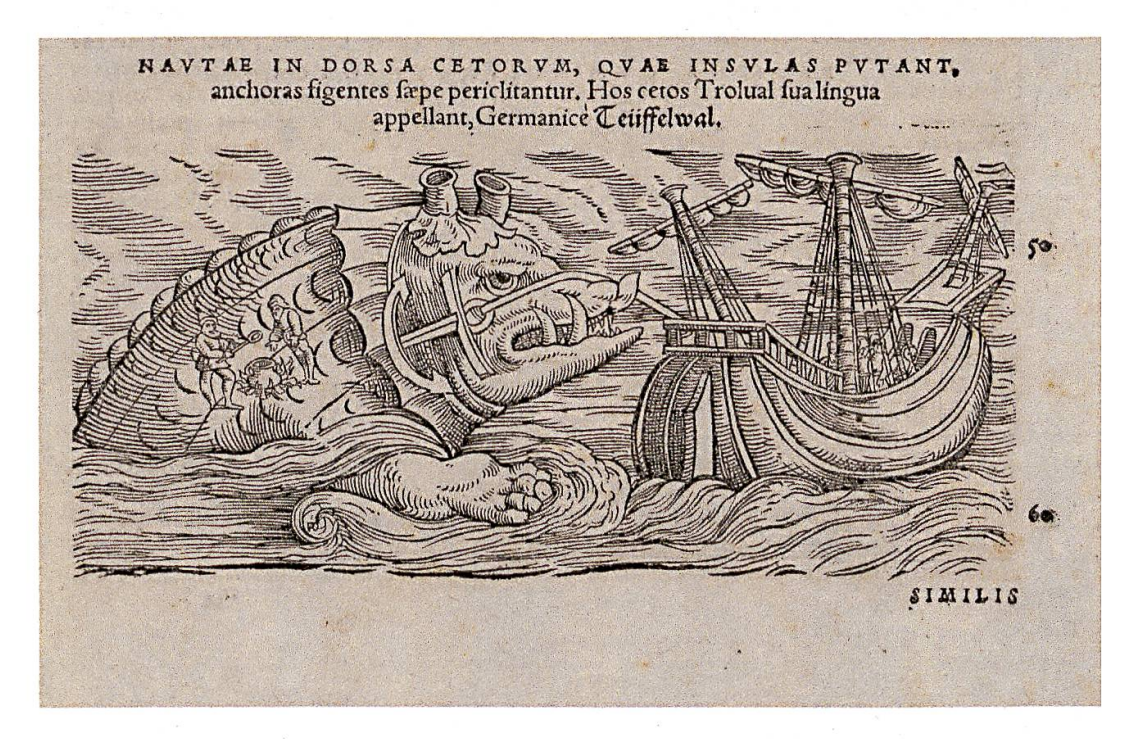
Figure 1: Detail of the Teüffelwal. Conradi Gesneri medici Tigurini Historiae animalium liber IIII. qui est de piscium & aquatilium animantium natura: cum iconibus singulorum ad vivum expressis fere omnib. DCCVI. Zürich, 1558, p. 138. Zentralbibliothek Zürich NNN 43. Reproduced with kind permission.

But what if we add another book of knowledge to the narrator's library? The Historia animalium , an encyclopaedic study of the animal kingdom by one of Zurich's most famous early modern polymaths, the philologist and physician Conrad Gessner. The 4-volume Historia animal ium was published in Zurich by Froschauer between 1551 and 1558 and in the course of over 3,500 folio pages Gessner aimed to collect everything written about animals by authors ancient and modern, and to include woodcut illustrations where possible. This image appears in Volume IV, the volume dedicated to fish and aquatic animals: