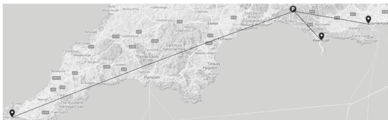
Figure 7. Migration destinations of paupers legally settled in Beaminster

Among the Dorset parishes, Beaminster (Figure 7) lies the furthest to the west. The three paupers writing back to this parish also stayed on the coast, moving to Weymouth and Poole (listed west to east), but also to the very distant Penzance, and nearby lead industry, in the far west.