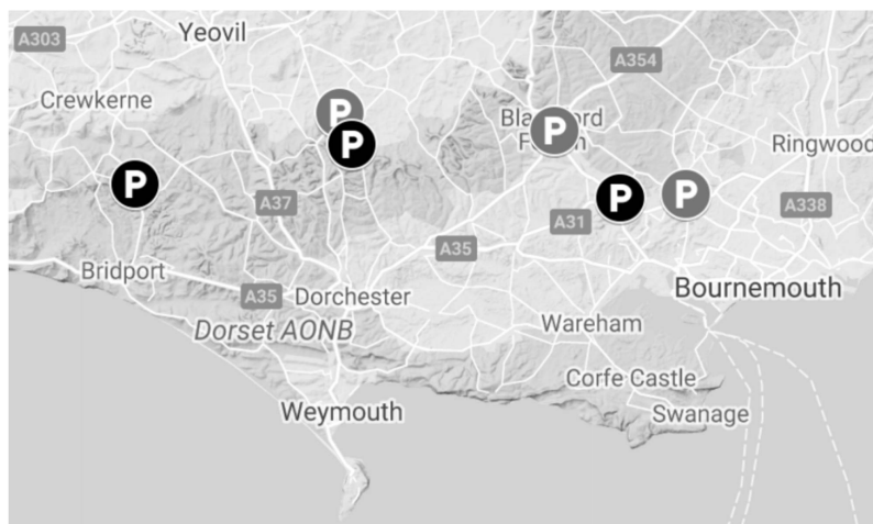
Figure 2. Six Dorset parishes receiving applications for out-relief 3

This section focuses on paupers applying for out-relief from their parish of legal settlement in Dorset, examining the migration patterns of these paupers, including distances travelled and typical trajectories in their movements. The analysis is based on 50 letters written between 1800 and 1835 by, or on behalf of, 27 paupers and their families (see Section 2 regarding authenticity of authorship). All of them have a legal settlement in one of six Dorset parishes (marked with a “P” in Figure 2), listed from west to east: Beaminster (3 paupers / 9 letters), Glanvilles Wootton (1 pauper / 1 letter), Buckland Newton (3 paupers / 4 letters), Blandford Forum (9 paupers / 17 letters), Sturminster Marshall (6 paupers / 8 letters), and Wimborne (7 paupers / 14 letters).