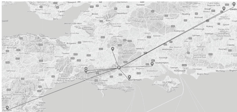
Figure 6. Migration destinations of paupers legally settled in Blandford Forum

One additional example of inland northwards migration, to Gillingham, is provided by the parish of Blandford Forum (Figure 6). Most of our data, a third of all letters, comes from this parish, and the migration patterns neatly mirror those seen before: the pull to move towards London and along the coast, even as far west as Plymouth. From west to east, the migration destinations are Plymouth, Netherbury, Beaminster, Gillingham, Poole, Lyndhurst, Brentford, and London.