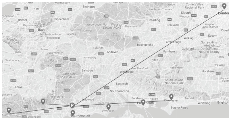
Figure 3. Migration destinations of paupers legally settled in Wimborne

Letters written to the parish of Wimborne display a very typical migration pattern (Figure 3). The paupers mainly moved eastwards, but also westwards, along the coastline, or up to London. Their destinations, from west to east, were Bridport, Cheselbourne, Bournemouth, Lymington, Portsmouth, Chichester, and London. Coastal towns with or near harbours could provide profitable trade as well as employment in the maritime sector, and were often home to small industry. London has, of course, been a magnet for those seeking work for centuries, and it also provided a wide spectrum of opportunities during the period of the Old Poor Law. The areas just outside London offered the second highest agricultural wages in the country. Towns in general were an attractive destination for migration for agricultural labourers with the promise of higher wages than in rural areas: the presence of (small) industry with even higher wages reduced the number of local workers in the agricultural sector (Redford 68–69).