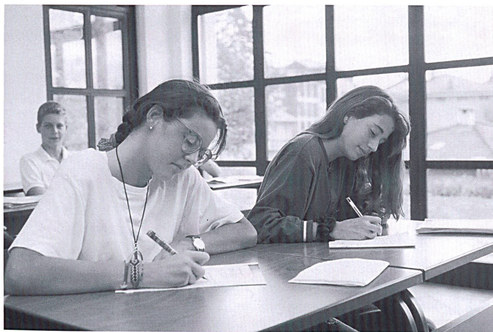
Students in a TASIS Classroom

of Vienna, Cambridge, London School of Economics and Keio University. Students are prepared for the SAT, TOEFL, Advanced Placement and International Baccalaureate exams, which are administered on campus. The School is accredited both in Europe by the European Council of International Schools and in the United States by the New England Asso-