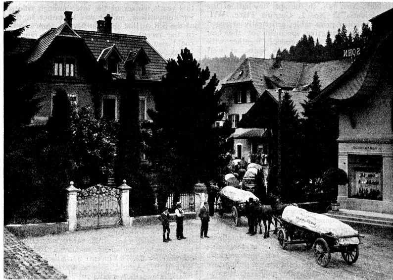
FARMERS DELIVERING "EMMENTALER."

This problem was solved by the admirable expedient of packing the cheese in cardboard boxes, a method which not only commended itself to the Swiss exporter, but met the particular require-