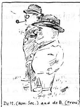
The Neuchâtel Mystery.

Memorable for the sheer joy of it—stern-visaged, red-trousered athletes from the Rhône Valley—a bewildering day of blue-eyed beauties—happy parents, happier children, music, laughter, cheers—a wealth of memories in it all.