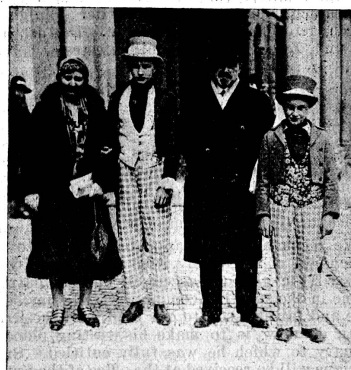
The Two Young Authors in a Family Group at the Zurich Sechseläuten.