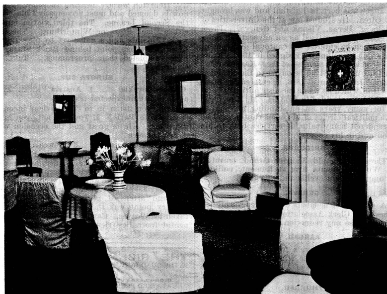
A corner view of the Popular "Swiss Parlour," at the Central Club.

The hostel, which is the first of its kind to be built in England, is open to all girls irrespective of class, creed or nationality, it is not a restrictive club. Young women will be able to entertain their men friends. "Mixed" tea parties can be given in the lounge. Membership of the Club costs only 12/6 a year.