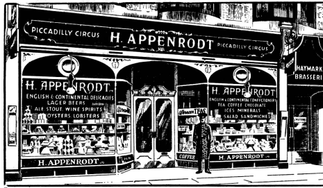
Piccadilly Circus and Top of Haymarket.