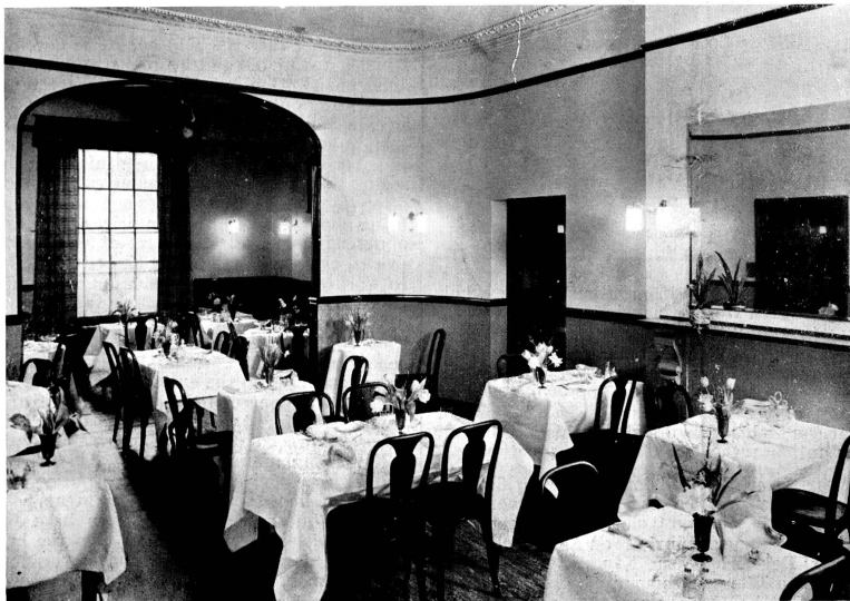
Section view of the Dining Room.

My visit was not quite complete; walking along a passage, a neatly uniformed chambermaid opened the door of a bathroom for my inspection. I have already pointed out that these