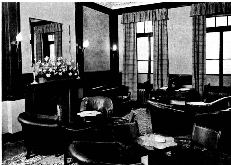
A corner of the Reading and Writing Room.

Casting a glance back over the Lounge on parting from my amiable guide I noticed a general look of contentment on the faces of the guests who were taking their coffee, and this is undoubtedly a proof that they are happy and comfortable at the "Foyer Suisse," I would be happy too, were I to stay there if still a bachelor.