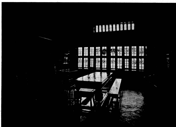
SHIBDEN HALL. House Body, showing 15th and 16th century windows.

By courtesy of Halifax Corporation Museums (Copyright).