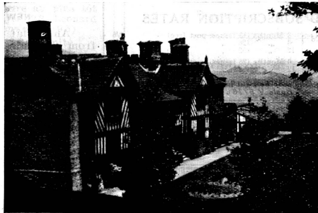
SHIBDEN HALL. The 15th century home of Anne Lister.

A hundred years ago there lived in an old timbered house in Yorkshire, (Shibden Hall, Halifax), a woman of outstanding character. In those days, when journeys were made with difficulty, by means of stage-coaches which travelled at ten miles an hour, it was not usual for women to travel a great deal; but this intrepid Yorkshirewoman, (Miss Anne Lister), not only posted through her own country, but also through Belgium, France, Switzerland, Spain, Denmark, Sweden, Germany and Russia. Her letters, and those of her family for over three hundred years back, have been carefully preserved at Shibden Hall and those relating to her tour in Switzerland are particularly interesting to-day, showing as they do conditions in Switzerland a hundred years ago.