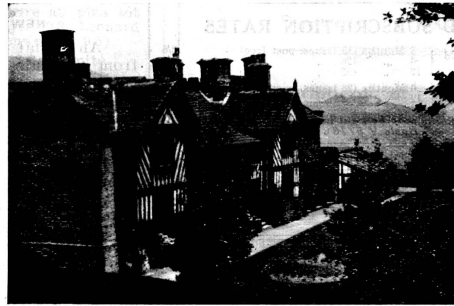
SHIBDEN HALL. The 15th century home of Anne Lister.

A hundred years ago there lived in an old timbered house in Yorkshire, (Shibden Hall, Halifax), a woman of outstanding character. In those days, when journeys were made with difficulty, by means of stage-coaches which travelled at ten miles an hour, it was not usual for women to travel a great deal; but this intrepid Yorkshirewoman, (Miss Anne Lister), not only posted through her own country, but also through Belgium, France, Switzerland, Spain, Denmark, Sweden, Germany and Russia. Her letters, and those of her family for over three hundred years back, have been carefully preserved at Shibden Hall and those relating to her tour in Switzerland are particularly interesting to-day, showing as they do conditions in Switzerland a hundred years ago.