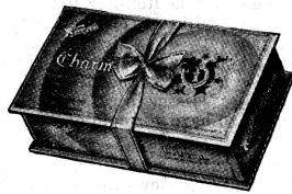
"CHARM" ½lb 2/- 1lb 4/-