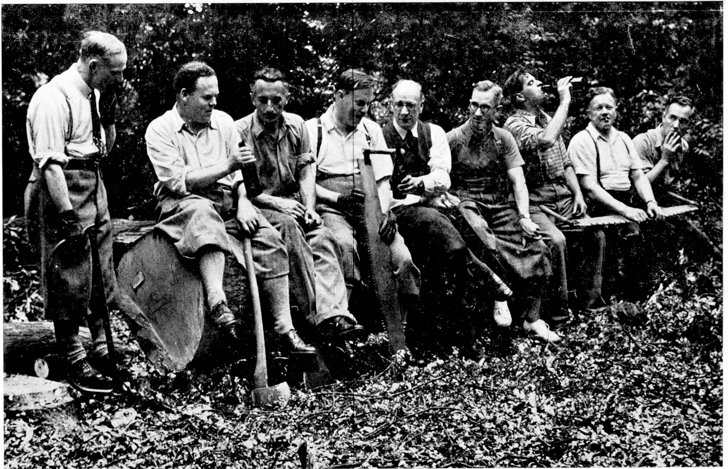
The same resting on their quarry.