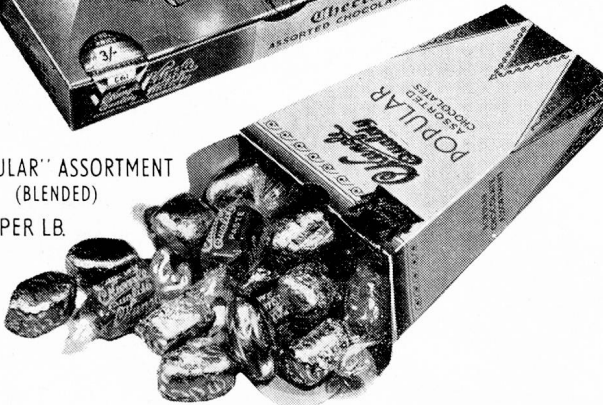
"POPULAR" ASSORTMENT (BLENDED) 4/6 PER LB.