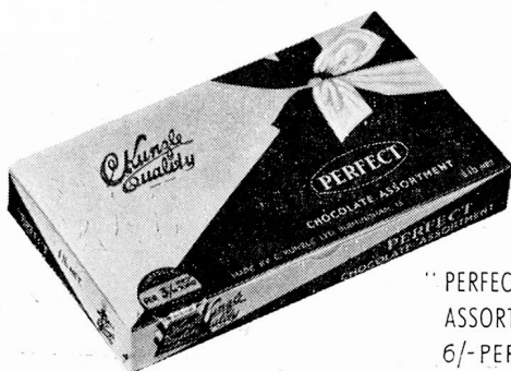
"PERFECT" ASSORTMENT 6/- PER LB.