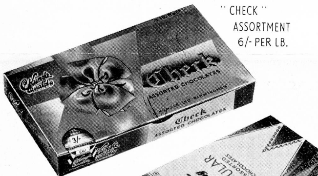
"CHECK" ASSORTMENT 6/- PER LB.