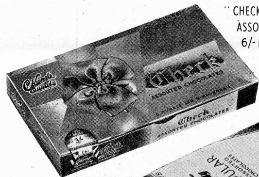
"CHECK" ASSORTMENT 6/- PER LB.