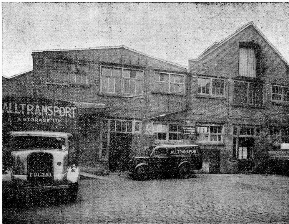
Our cartage and packing depot at Eagle Wharf Road, New North Road, N.1.