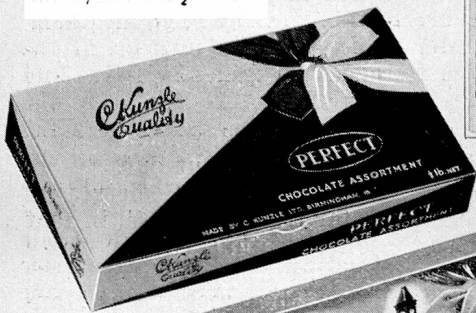
"PERFECT" ASSORTMENT 2/10 PER 1/2 LB.