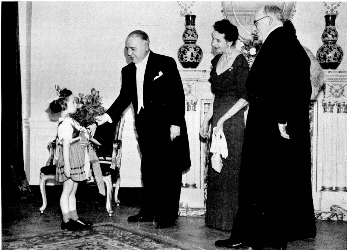
Presentation of a Bouquet to the Swiss Minister.

Having said all this, I will now endeavour to give a description of the happy 100th birthday party.