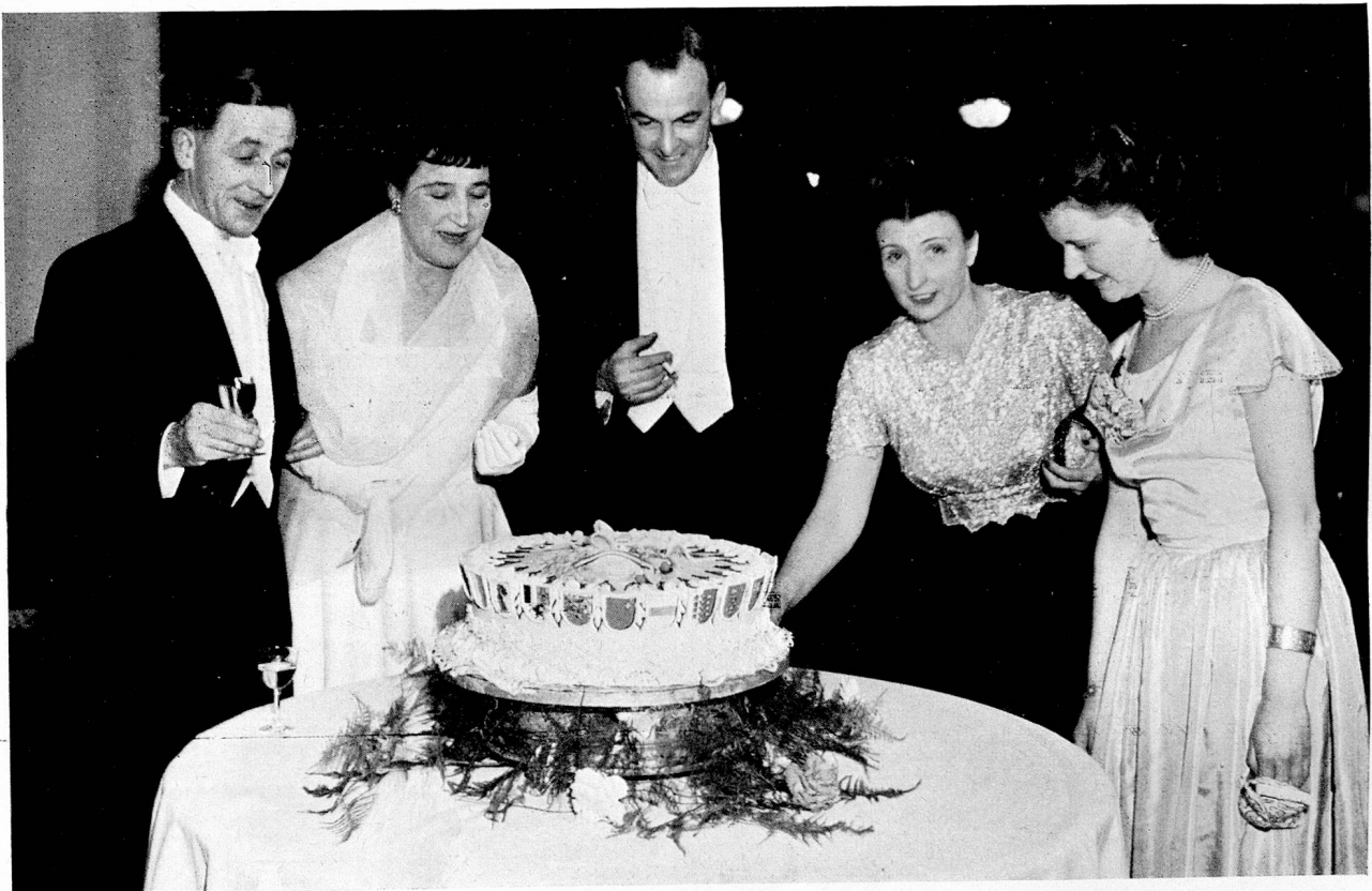
The "Birthday" Cake.

It also seemed that in the eighties, there existed two Swiss Societies in Manchester, the Swiss Club and the "Alpenrösli" Club, which apparently, faithful to