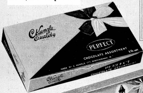
"PERFECT" ASSORTMENT 2/10 PER 1/2 LB.