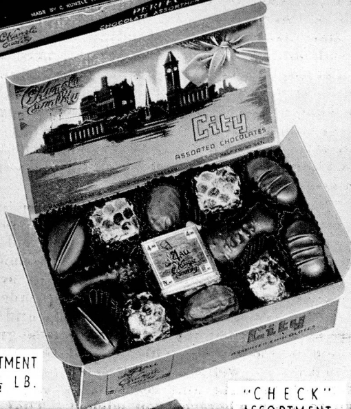
"CITY" ASSORTMENT 2/2 PER 1/2 LB.