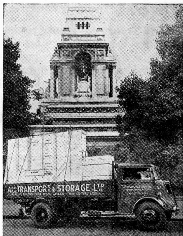
Traffic to and from all parts of the World

Official Passenger Agents for all Principal Steamship Companies - Official Freight & Passenger Agents for all Air Lines