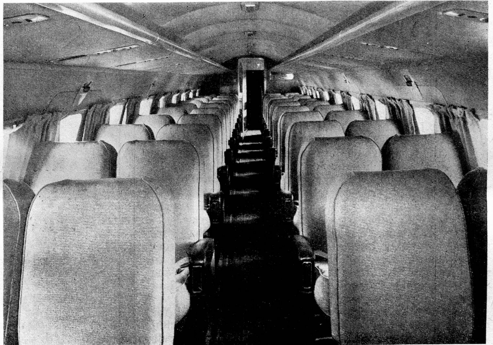
INTERIOR OF "CONVAIRE"

The flight from Northolt to Geneva thus having taken exactly 1 hour and fifty minutes, or 20 minutes