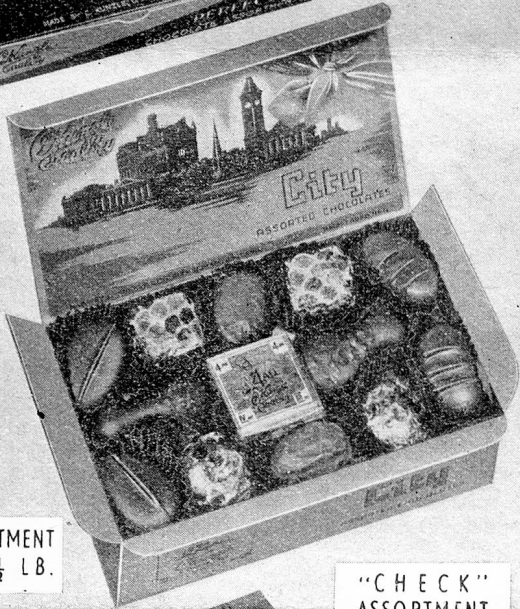
"CITY" ASSORTMENT 2/2 PER ½ LB.