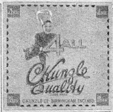
"PERFECT" ASSORTMENT 2/10 PER ½ LB.