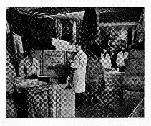
Our expert Staff pack and ship valuable Furs to all parts of the World

Official Passenger Agents for all Principal Steamship Companies - Official Freight & Passenger Agents for all Air Lines.