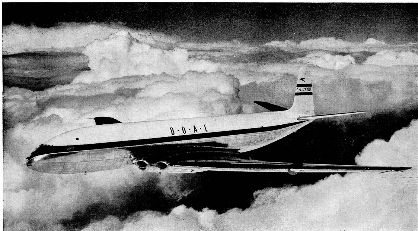
COMET IN FLIGHT.

As with every other aircraft, the engines are kept running for quite a while with the "Comet" whilst the aeroplane is stationary on the ground. The noise which the engines make, sounds from without like a very high, penetrating whistle. Inside the aircraft, however, once the door is closed, the noise is perhaps comparable to the sound of the motor of a vacuum-cleaner. This characteristic noise of the jet-engine has already caused the English public to speak of the "Flying tea-kettle", a reference which needs no explanation but speaks for itself. The actual start, with