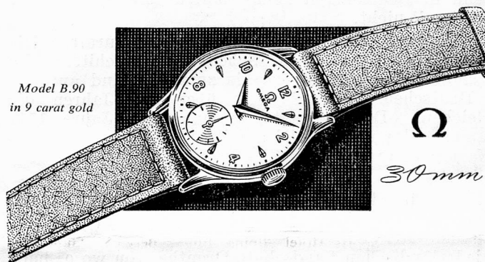
Model B.90 in 9 carat gold

OLYMPIC GAMES — For 20 years Omega has timed the Olympic Games. In 1952 the most exacting and impartial experts chose Omega to time the Helsinki Olympics, the biggest assignment that can be given to a precision watch.