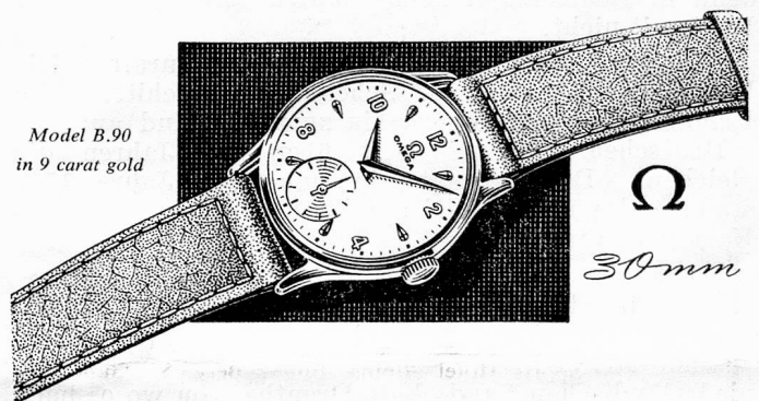
Model B.90 in 9 carat gold

OLYMPIC GAMES — For 20 years Omega has timed the Olympic Games. In 1952 the most exacting and impartial experts chose Omega to time the Helsinki Olympics, the biggest assignment that can be given to a precision watch.