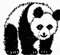
Regd. Trade Mark

... because they are made under Swiss management. You will agree when you see the wonderfully gay check, spotted, striped or tartan Hair Ribbons in all widths and colours, and the other fine-quality PANDA lines for millinery, corsetry and tailoring.