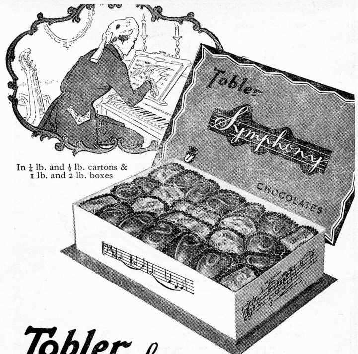
In ½ lb. and ¼ lb. cartons & 1 lb. and 2 lb. boxes

The American Ambassador, Miss Francis Willis, was officially received by the rector of the University